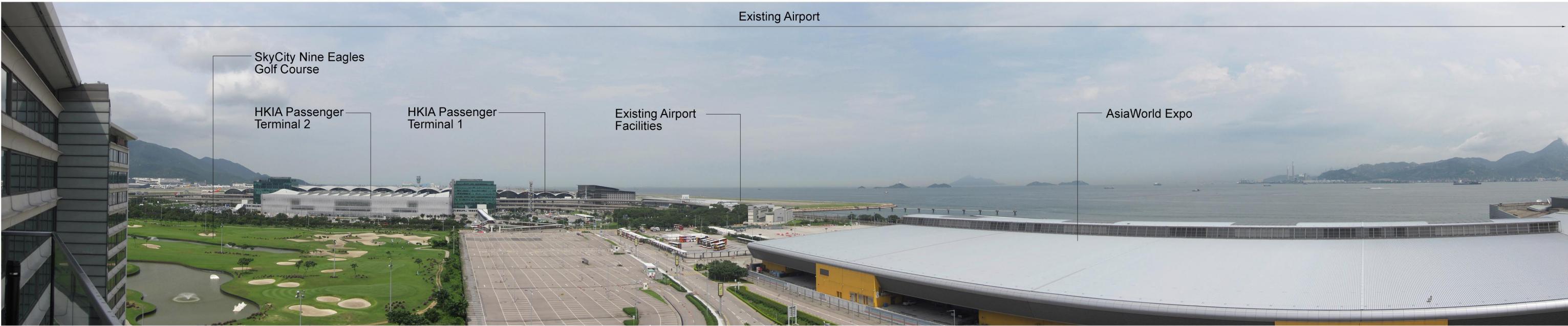
Existing Baseline Conditions in June 2013