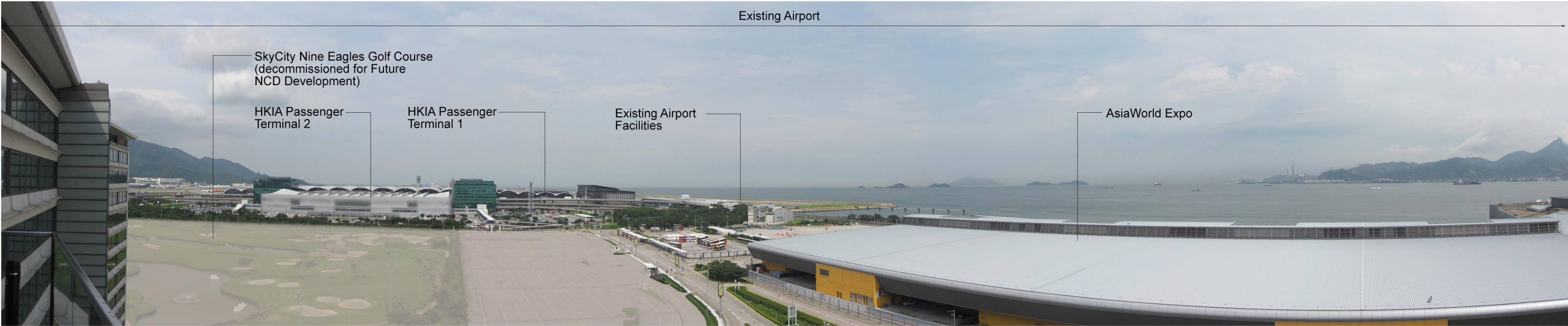
Planned Baseline Conditions in 2016 Before Commencement of the 3RS (with Committed and Approved Projects: HKBCF, HKLR, the Southern Connection of TM-CLKL, Residential/Commercial Development at Tung Chung (Area 55A), Residential Development at Tung Chung (Area 55B) and Residential Development at Tung Chung (Area 56))