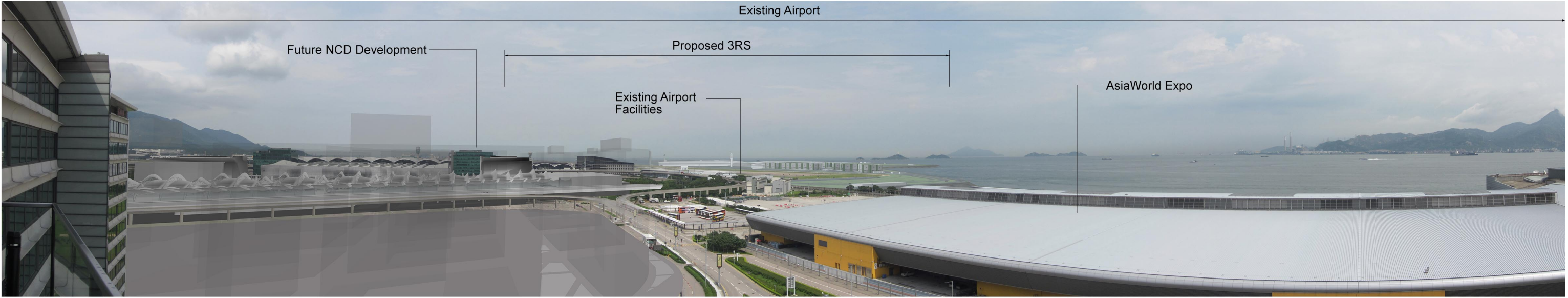
Proposed Development with Mitigation at Year 10 (Operation Phase)

Note: The layout for the proposed NCD is indicative only