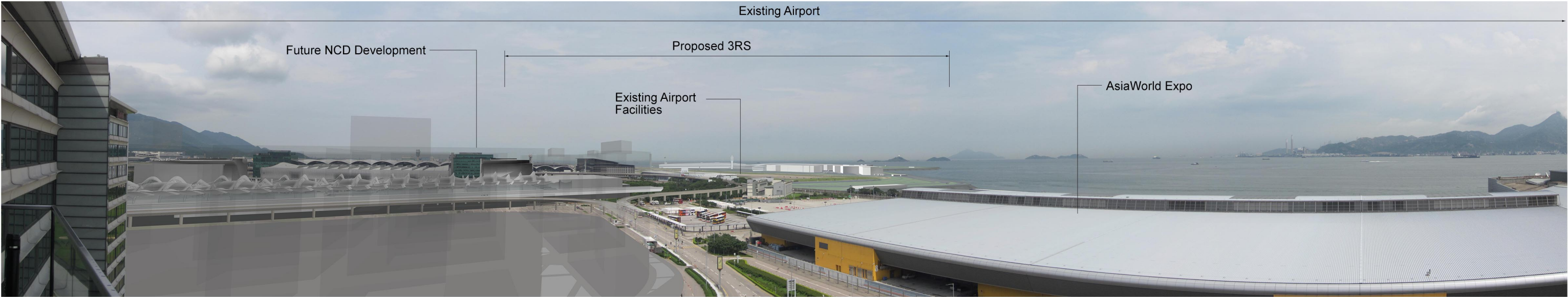
Proposed Development without Mitigation at Day 1 (Operation Phase)