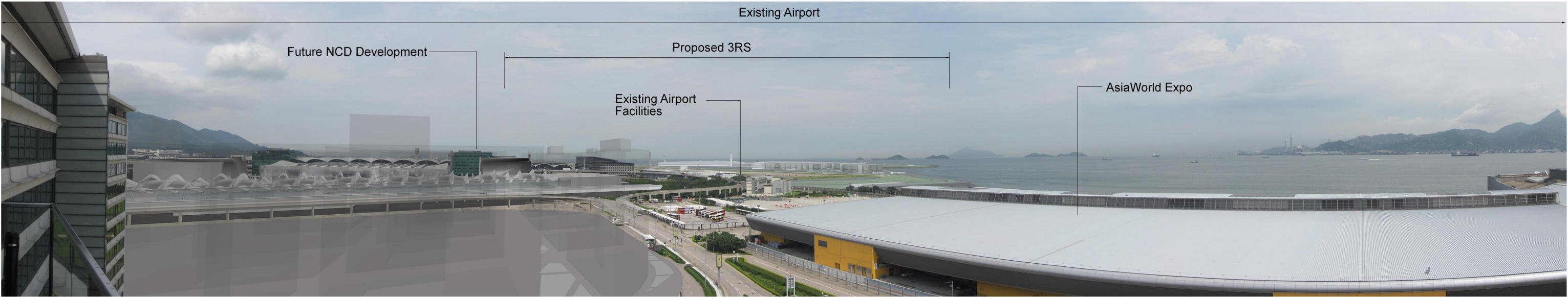
Proposed Development with Mitigation at Day 1 (Operation Phase)