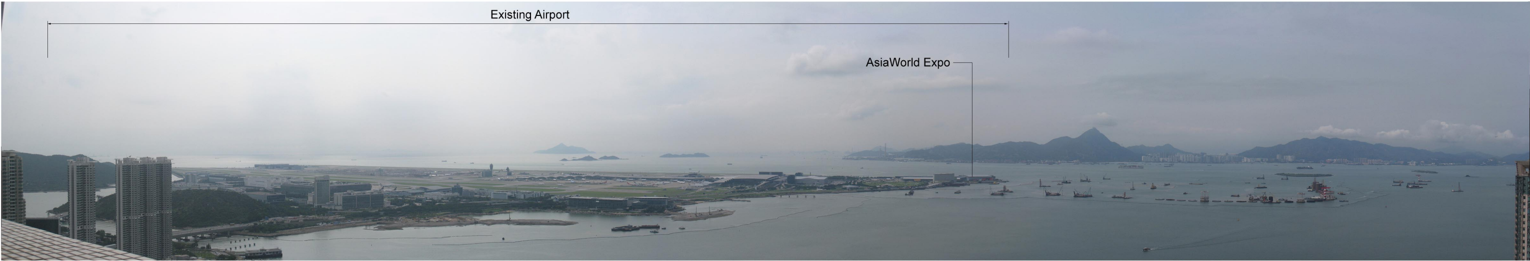
Existing Baseline Conditions in June 2013