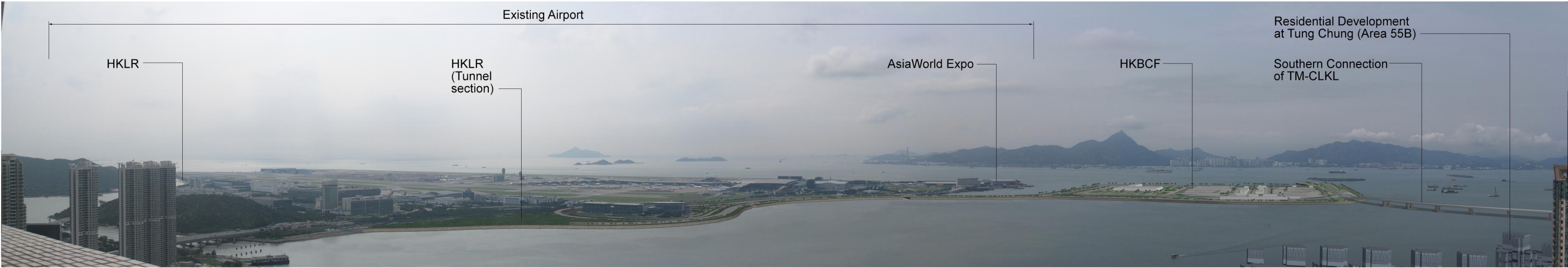
Planned Baseline Conditions in 2016 Before Commencement of the 3RS (with Committed and Approved Projects: HKBCF, HKLR, the Southern Connection of TM-CLKL, Residential/Commercial Development at Tung Chung (Area 55A), Residential Development at Tung Chung (Area 55B) and Residential Development at Tung Chung (Area 56))