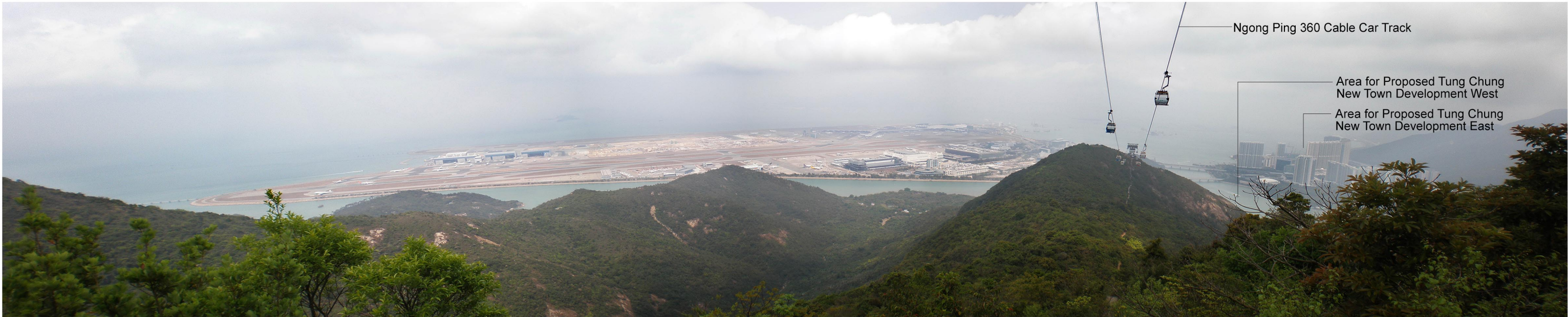
Existing Baseline Conditions in June 2013