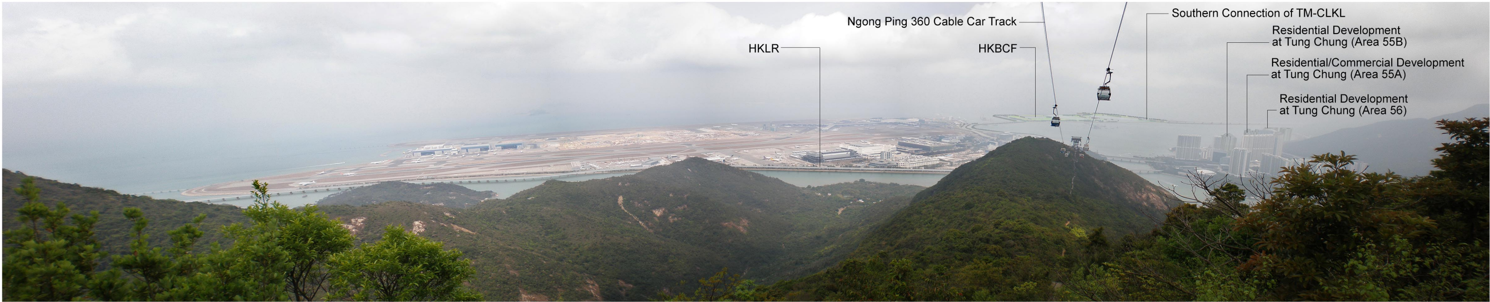
Planned Baseline Conditions in 2016 Before Commencement of the 3RS (with Committed and Approved Projects: HKBCF, HKLR, the Southern Connection of TM-CLKL, Residential/Commercial Development at Tung Chung (Area 55A), Residential Development at Tung Chung (Area 55B) and Residential Development at Tung Chung (Area 56))

Note: The layouts for the Residential/Commercial Development at Tung Chung (Area 55A), the Residential Development at Tung Chung (Area 55B) and the Residential Development at Tung Chung (Area 56) are indicative only