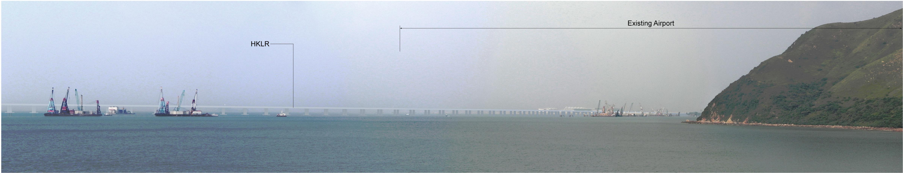
Planned Baseline Conditions in 2016 Before Commencement of the 3RS (with Committed and Approved Projects: HKBCF, HKLR, the Southern Connection of TM-CLKL, Residential/Commercial Development at Tung Chung (Area 55A), Residential Development at Tung Chung (Area 55B) and Residential Development at Tung Chung (Area 56))