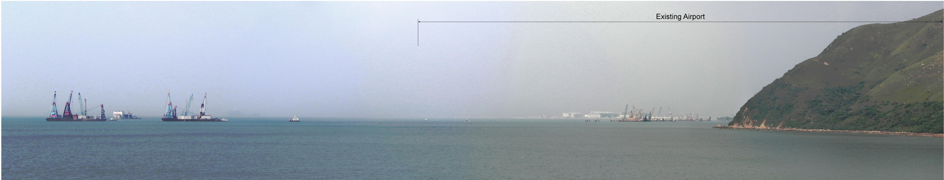
Existing Baseline Conditions in June 2013