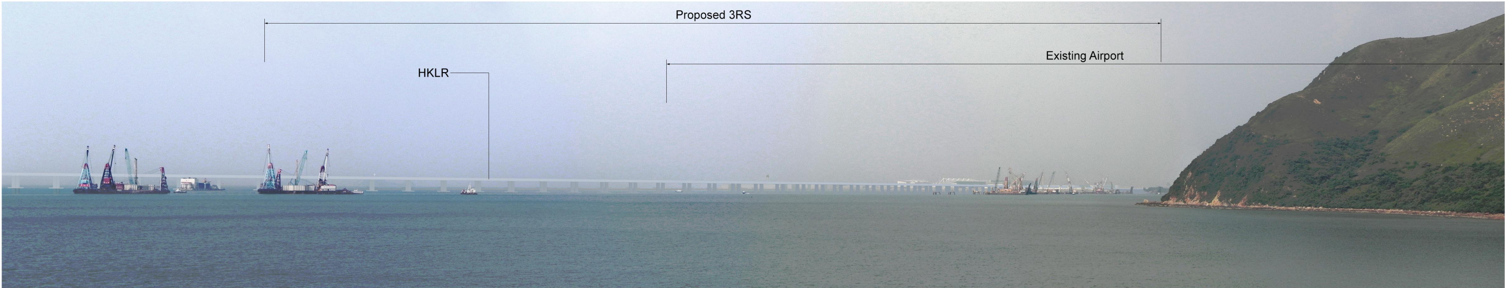
Proposed Development with Mitigation at Year 10 (Operation Phase)