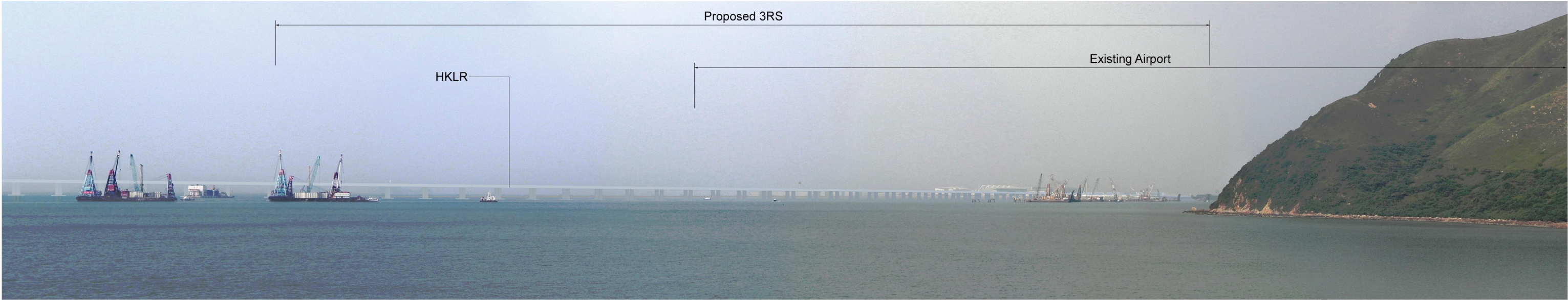
Proposed Development with Mitigation at Day 1 (Operation Phase)