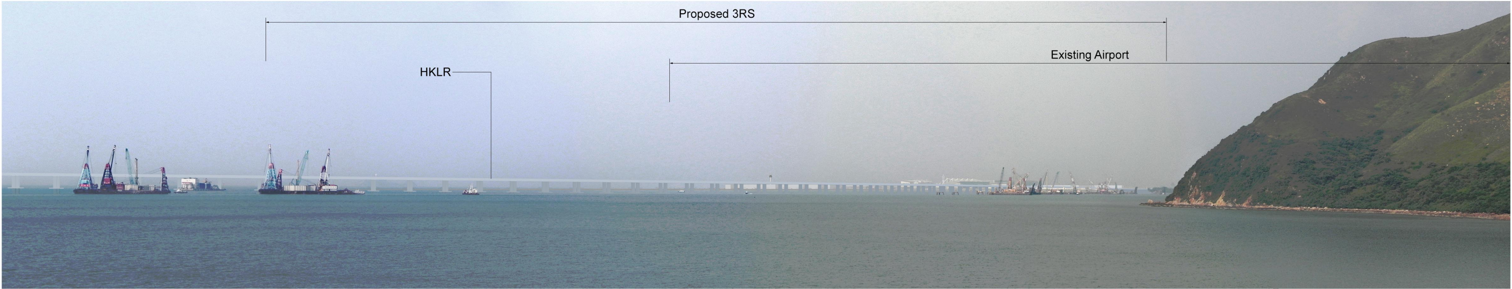
Proposed Development without Mitigation at Day 1 (Operation Phase)