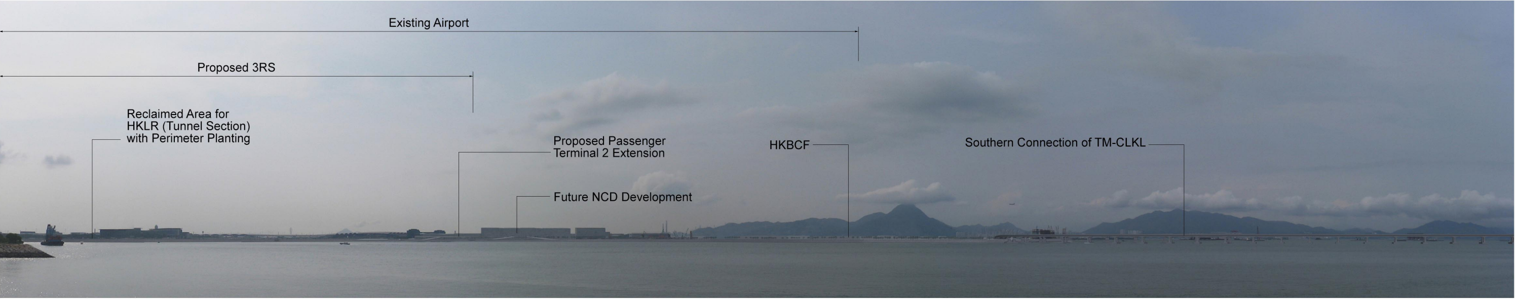
Proposed Development with Mitigation at Day 1 (Operation Phase)