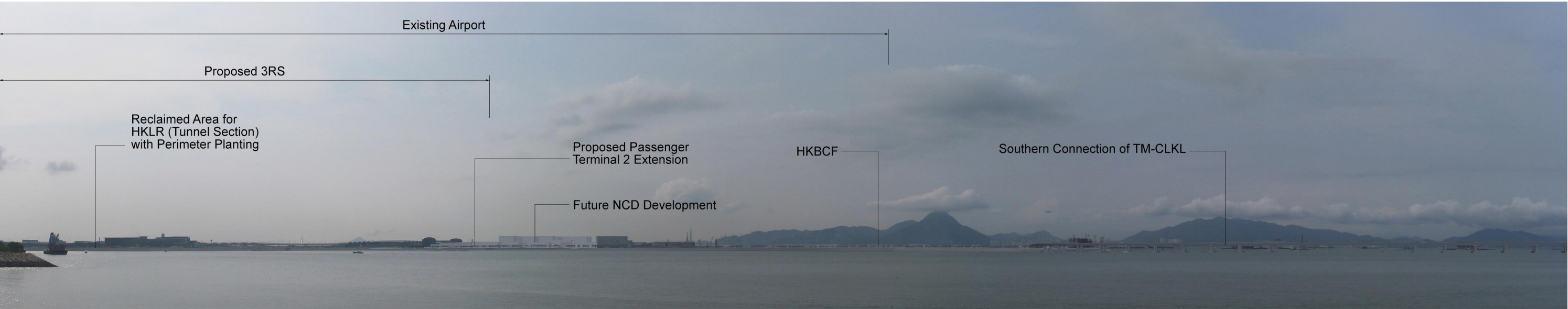
Proposed Development without Mitigation at Day 1 (Operation Phase)