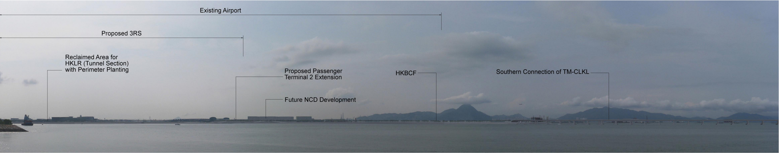
Proposed Development with Mitigation at Year 10 (Operation Phase)