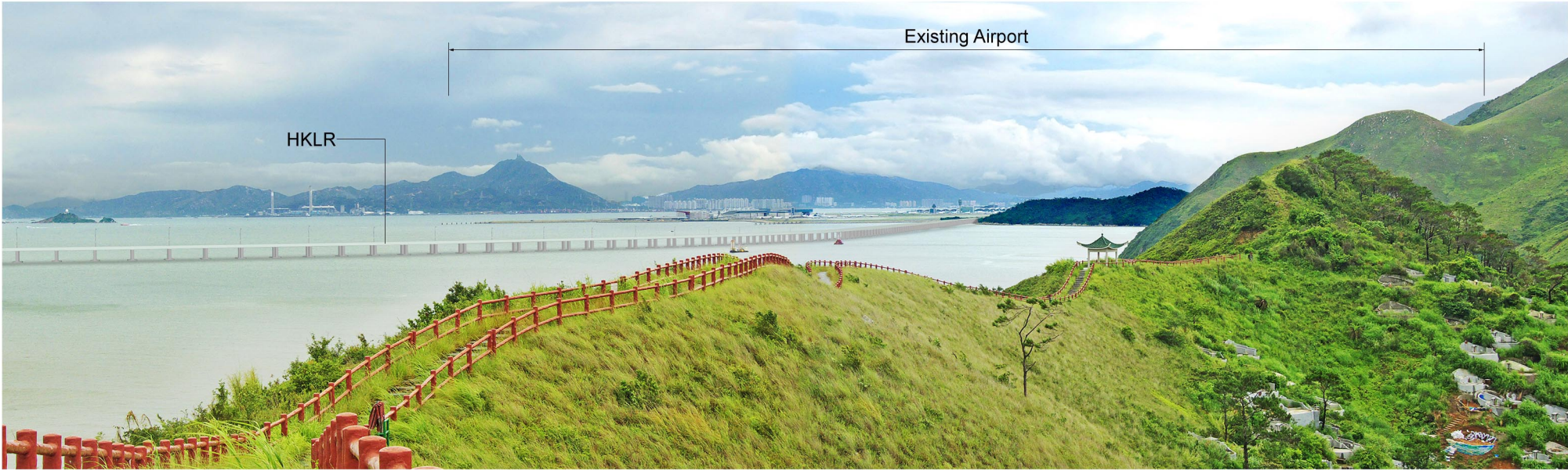
Planned Baseline Conditions in 2016 Before Commencement of the 3RS (with Committed and Approved Projects: HKBCF, HKLR, the Southern Connection of TM-CLKL, Residential/Commercial Development at Tung Chung (Area 55A), Residential Development at Tung Chung (Area 55B) and Residential Development at Tung Chung (Area 56))