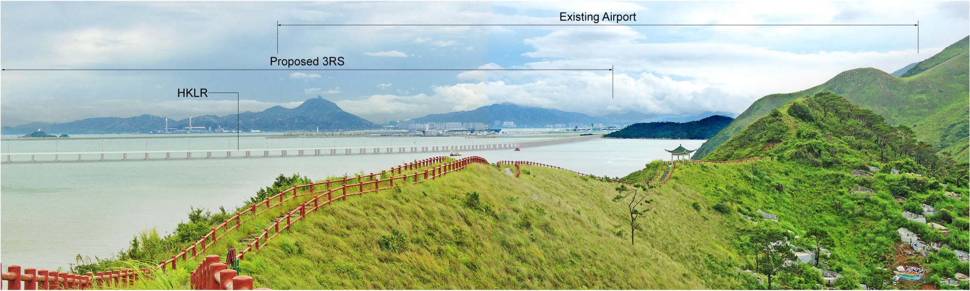
Proposed Development with Mitigation at Day 1 (Operation Phase)