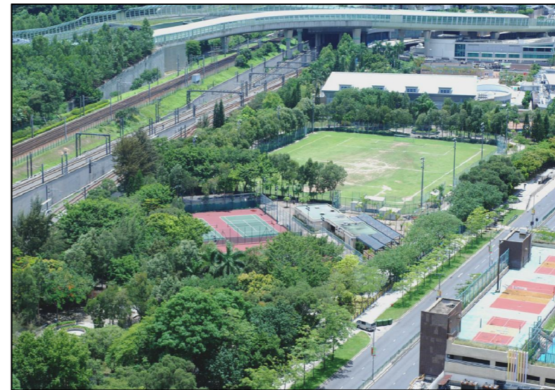
LR6 HIN TIN PLAYGROUND AND FOOTBALL FIELD