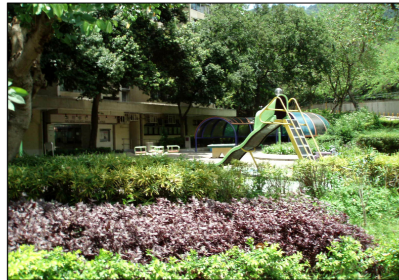
LR5 LANDSCAPE AREAS AT HIN KENG ESTATE