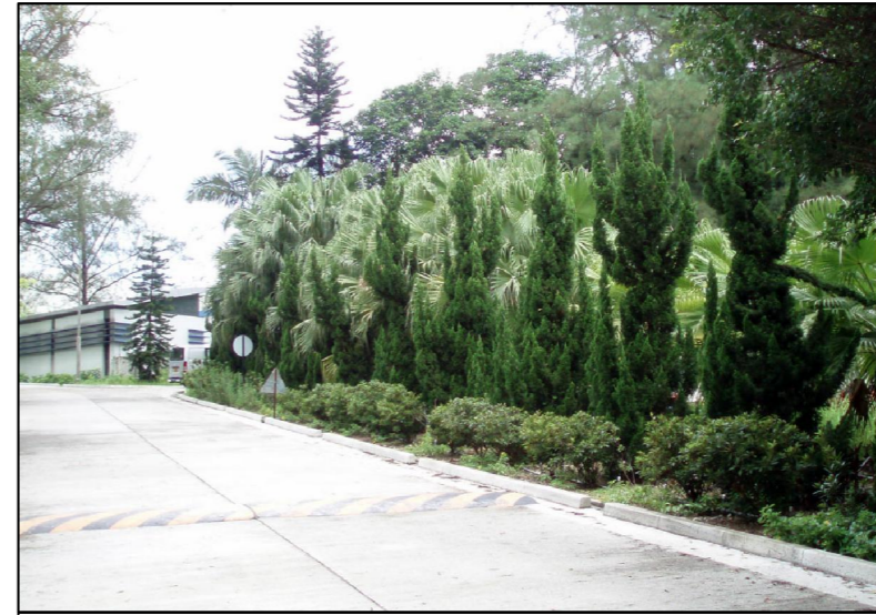
LR3 LANDSCAPE AMENITY AREA AT SHA TIN WTW