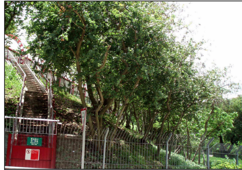
LR2 MAN MADE SLOPE AREAS