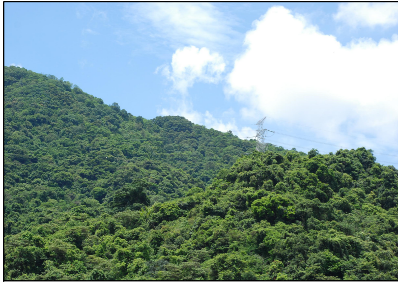
LR1 NATURAL HILLSIDE WOODLAND