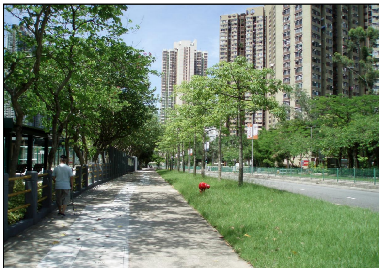
LR7 ROADSIDE PLANTING ALONG CHE KUNG MIU ROAD