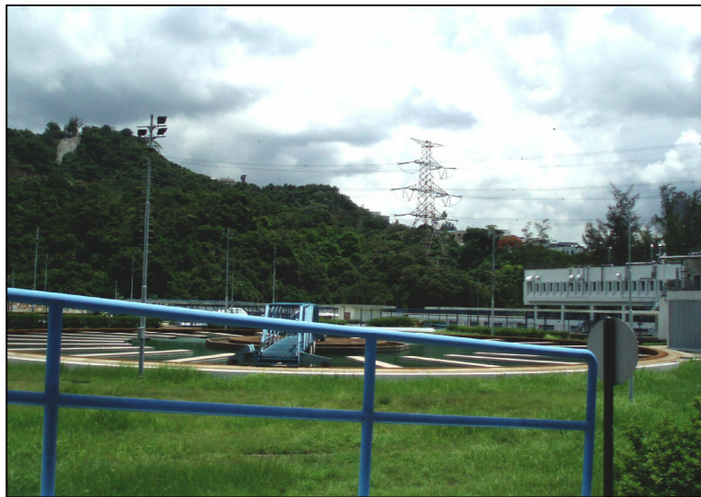
LR4 LAWN AREA