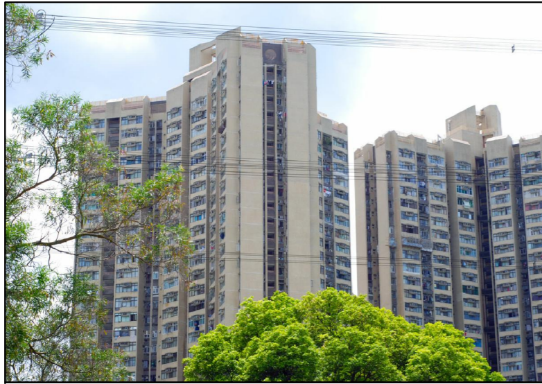
R1 HIN TIN ESTATE