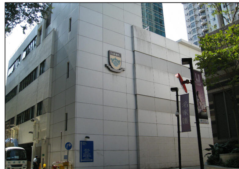
GIC1 UNION HOSPITAL