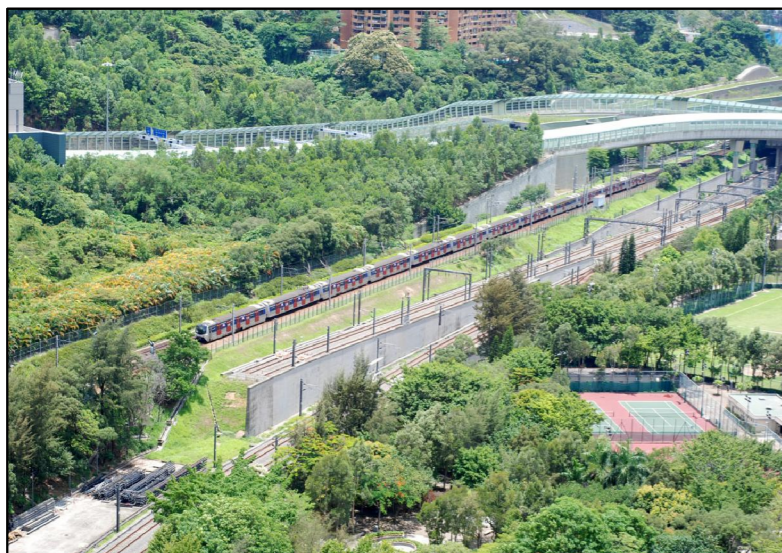
T1 TRAVELERS ON EAST RAIL