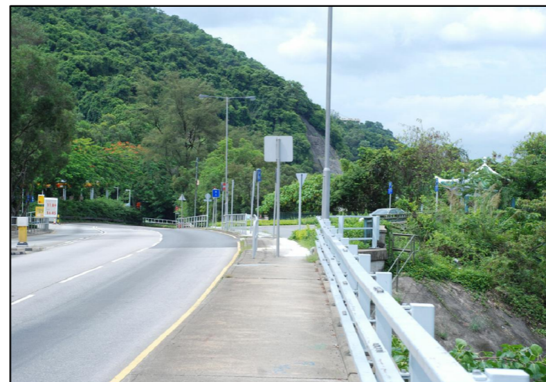
T2 TAI PO ROAD