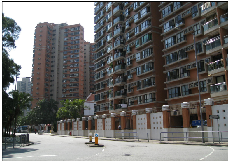
R4 PARC ROYALE