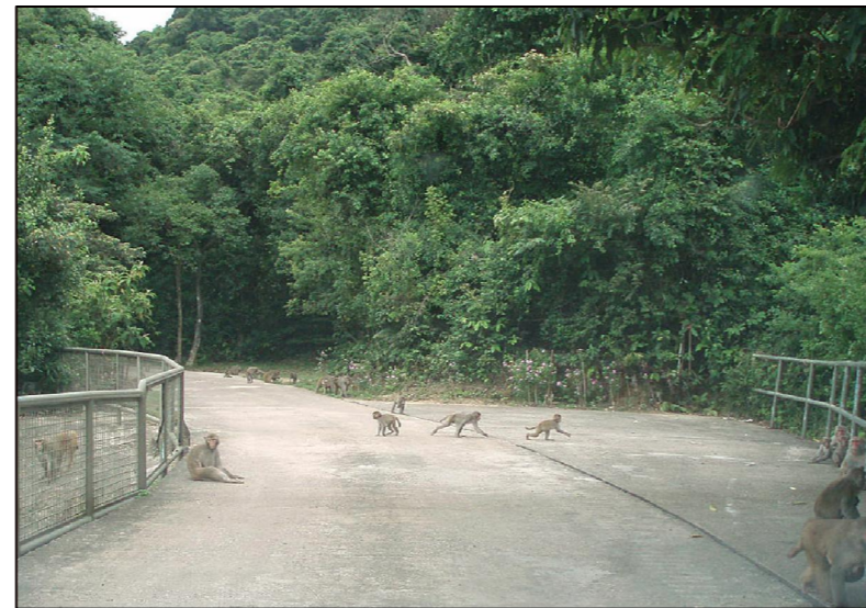
O1 WILSON TRAIL (STAGE 5)