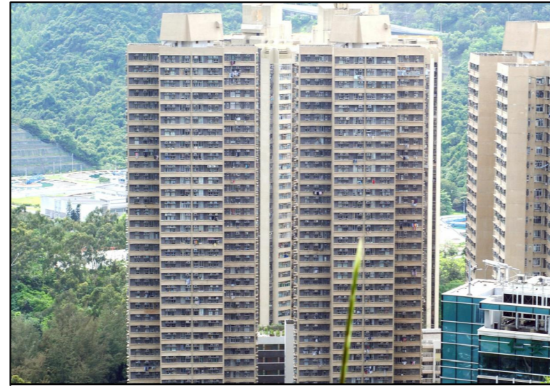
R2 HIN KENG ESTATE AND KA TIN COURT