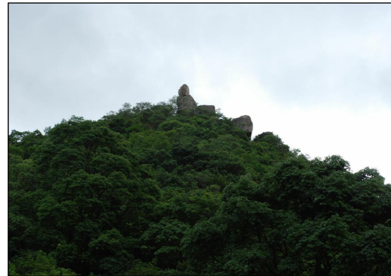
O2 HIKERS AT AMAH ROCK IN LION ROCK COUNTRY PARK