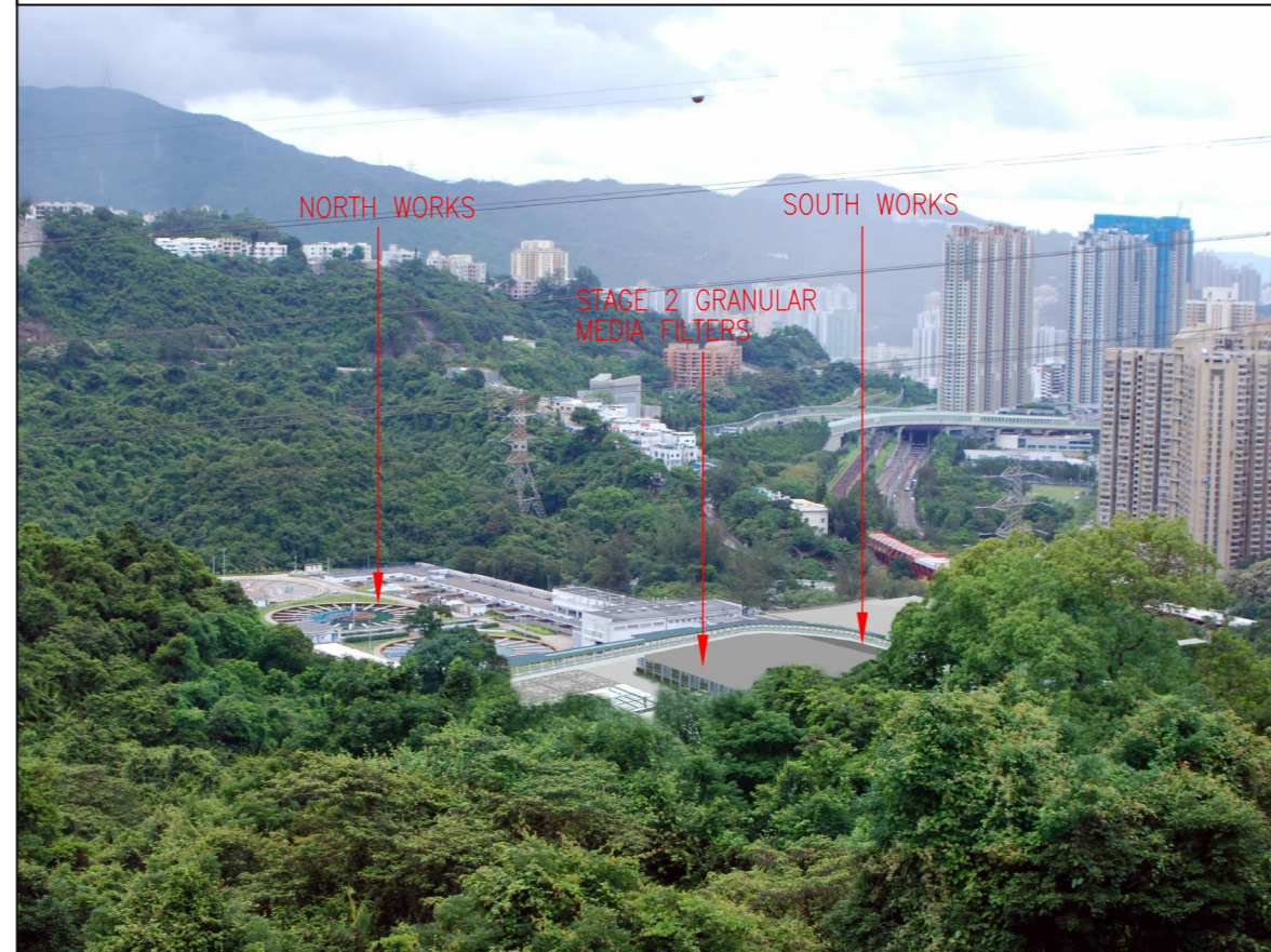
DAY 1 WITHOUT MITIGATION