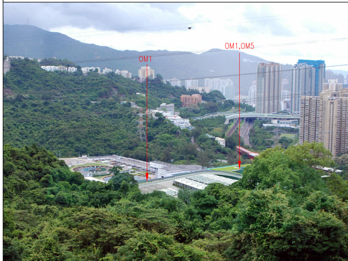
DAY 1 WITH MITIGATION