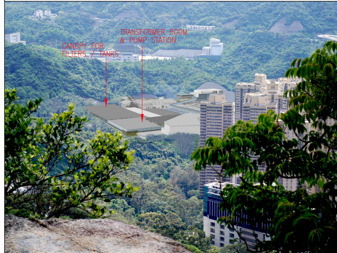
DAY 1 WITHOUT MITIGATION