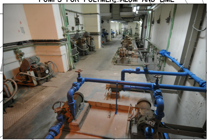
PUMPS FOR POLYMER, ALUM AND LIME