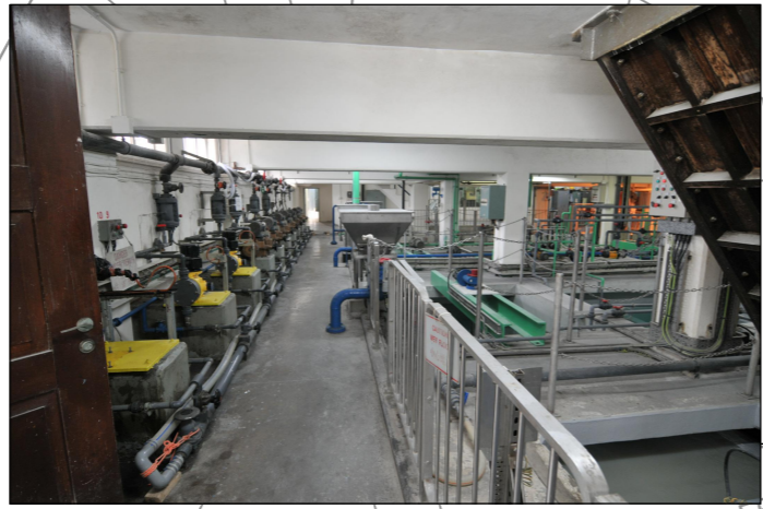
PUMPS FOR FLUORIDE