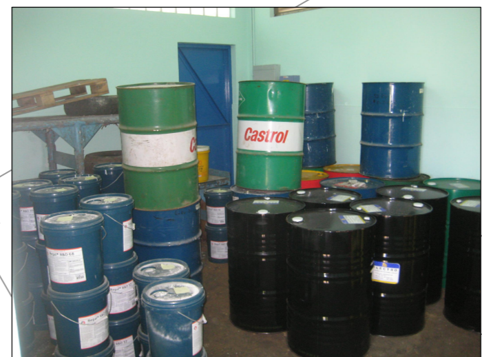
DANGEROUS GOODS STORE OF MECHANICAL & ELECTRICAL MAINTENANCE DIVISION