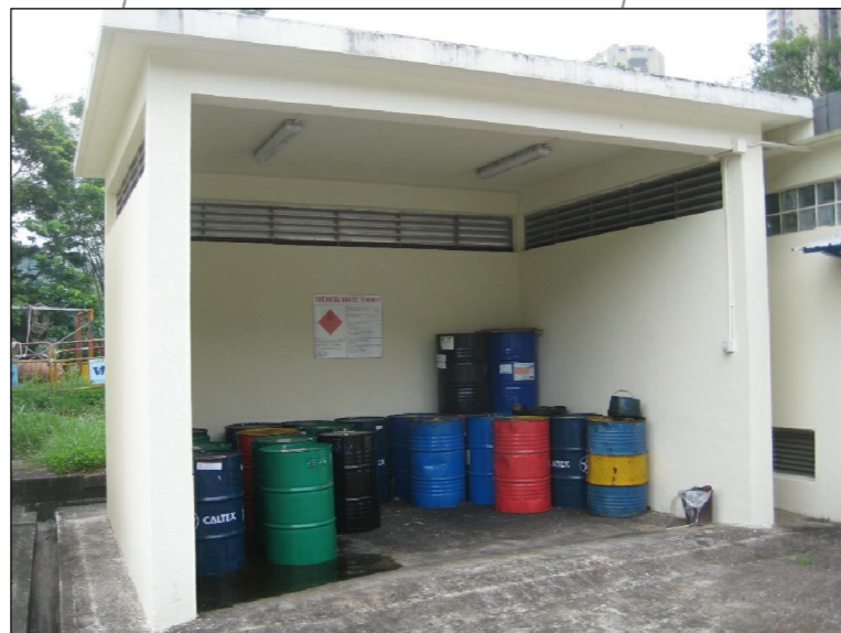
CHEMICAL WASTE STORAGE AREA