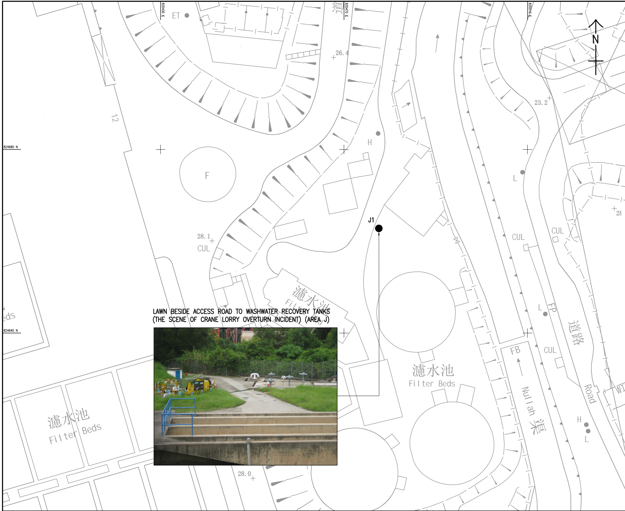
LAWN BESIDE ACCESS ROAD TO WASHWATER RECOVERY TANKS (THE SCENE OF CRANE LORRY OVERTURN INCIDENT) (AREA J)