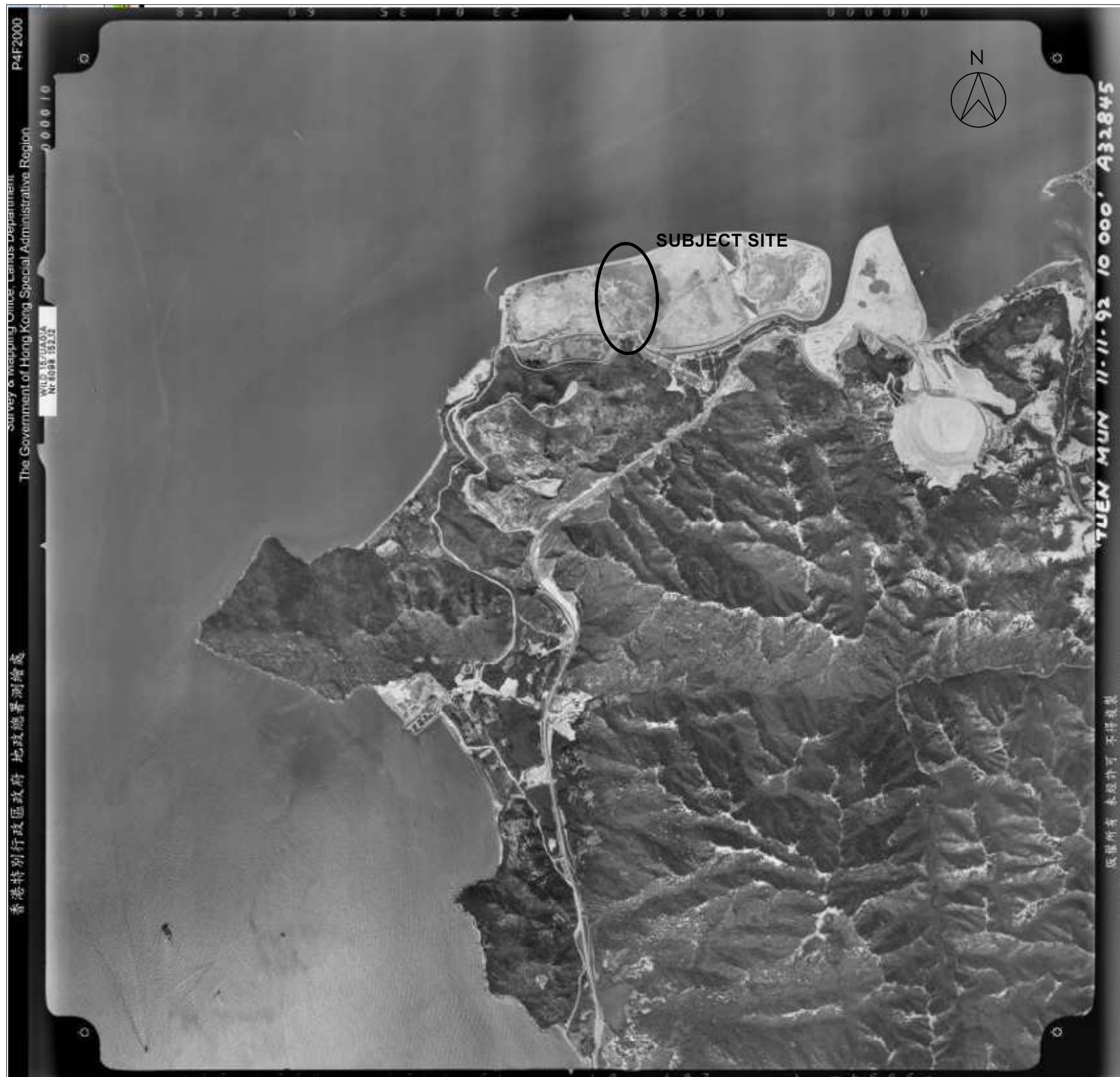
ENVIRONMENTAL IMPACT ASSESSMENT FOR DECOMMISSIONING OF WEST PORTION OF THE MIDDLE ASH LAGOON AT TSANG TSUI, TUEN MUN