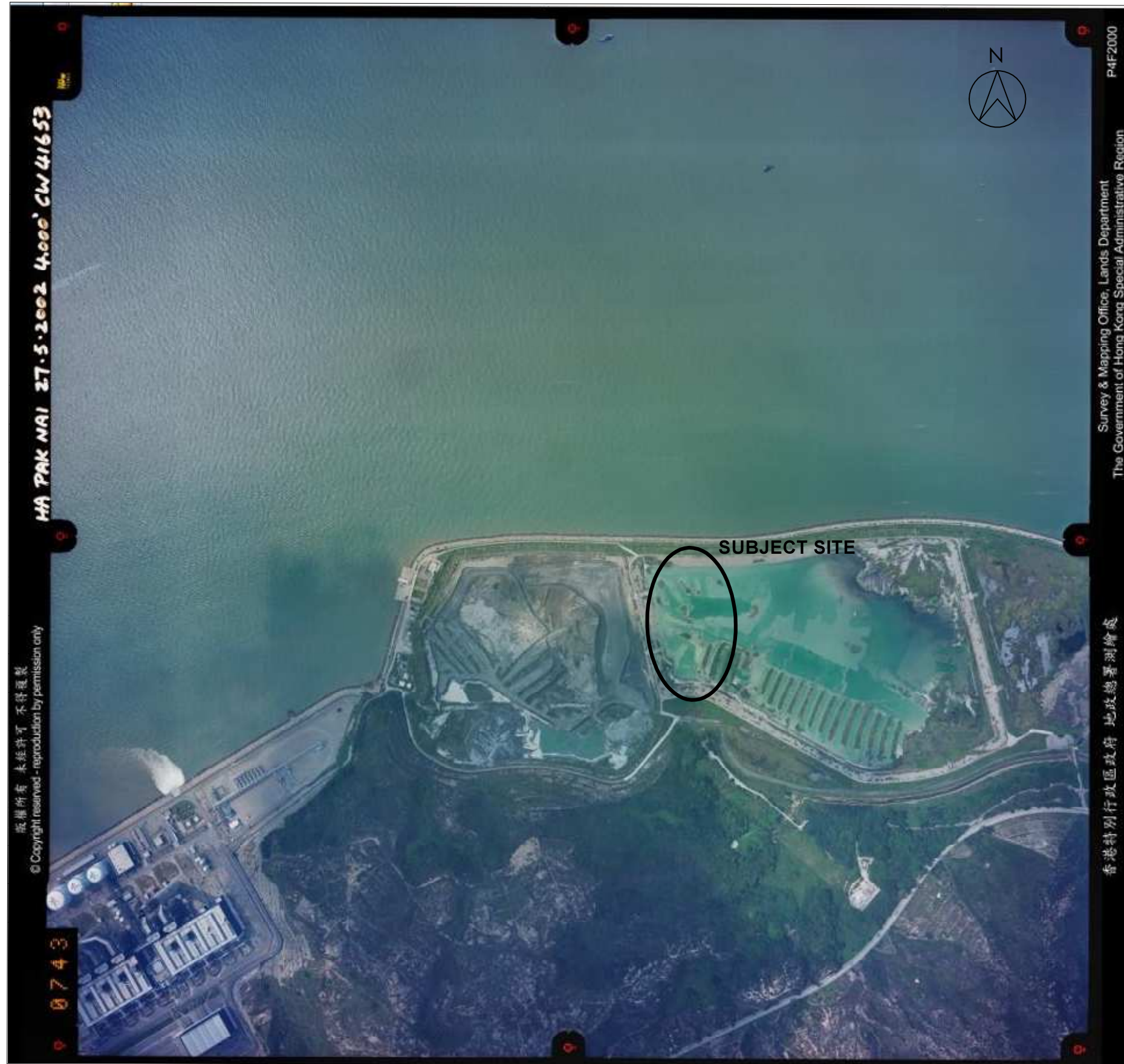
ENVIRONMENTAL IMPACT ASSESSMENT FOR DECOMMISSIONING OF WEST PORTION OF THE MIDDLE ASH LAGOON AT TSANG TSUI, TUEN MUN