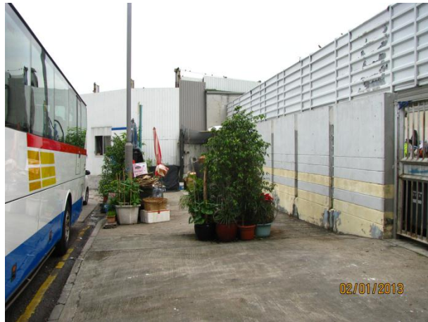
LR2 – Roadside Vegetation – potted plants outside refuse collection point