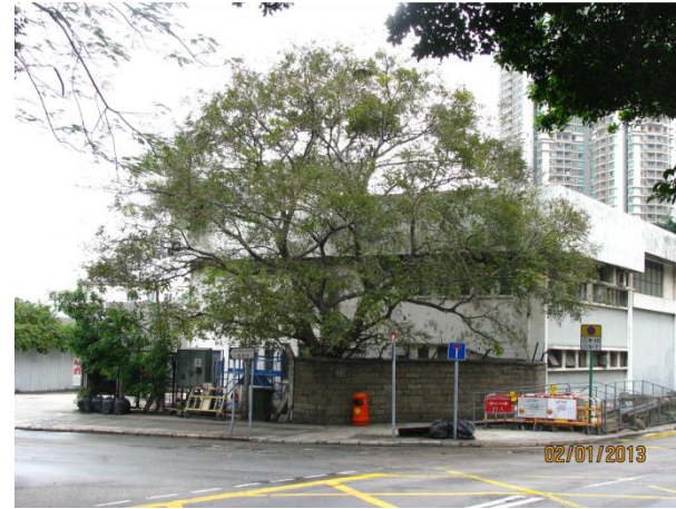
LR2 – Roadside Vegetation – trees near roadside