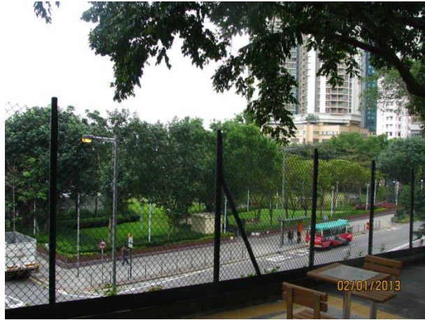
LR1 – Cadogan Street Temporary Garden – overall view