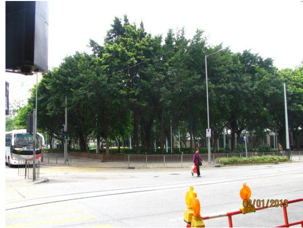
LR1 – Tree Planting in Cadogan Street Temporary Garden