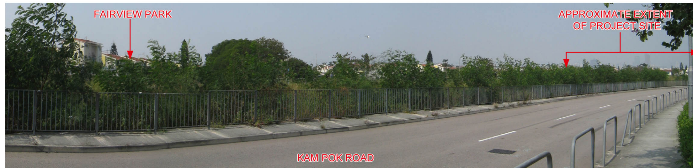
VIEW POINT 15 (O3): VIEW FROM CHUK YUEN FLOODWATER PUMPING STATION