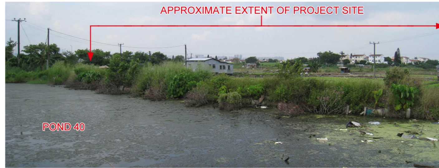
VIEW POINT 13 (R4): VIEW FROM SOUTH-WESTERN EDGE OF YAU MEI SAN TSUEN