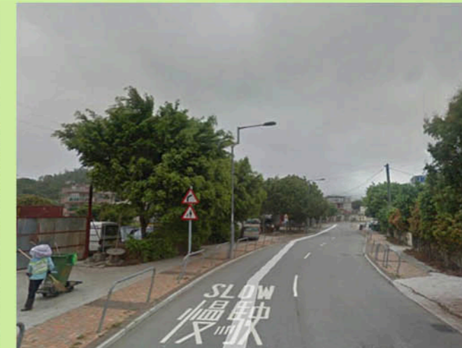
Yau Mei San Tsuen Village