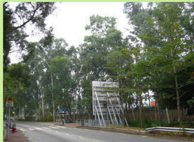
Castle Peak Road