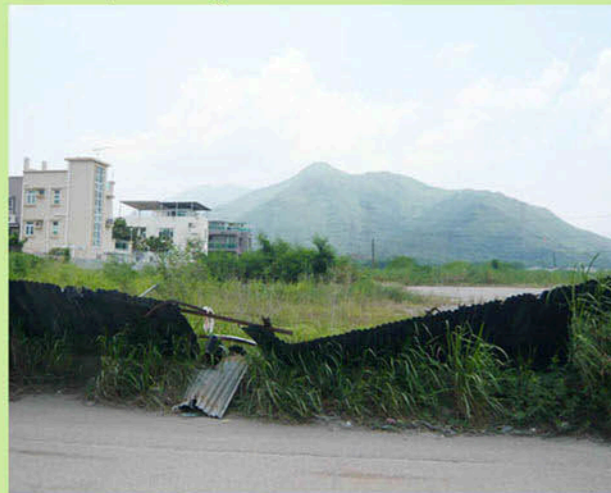
Vacant Lot south of Man Yuen Chuen