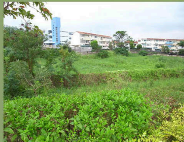
LR6.A - Grassland/ Shrubland