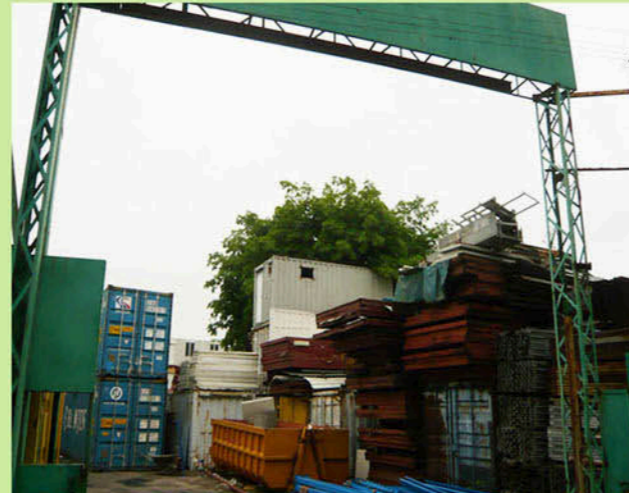
Open Storage west of Castle Peak Road