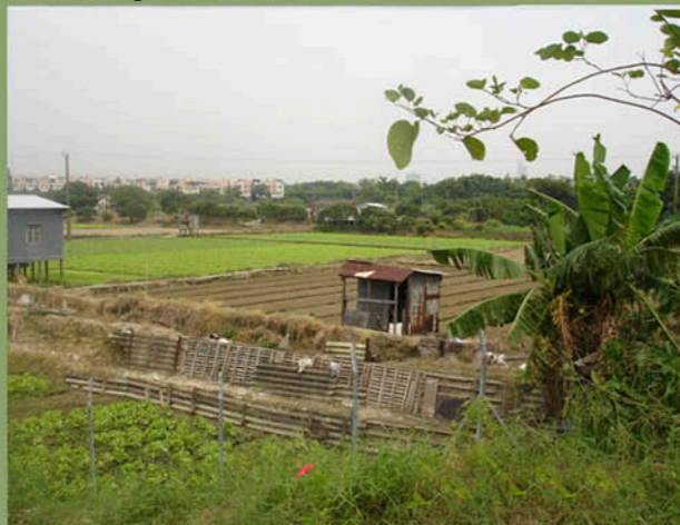
LR4.A - Agricultural Land