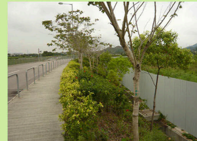
Kam Pok Road