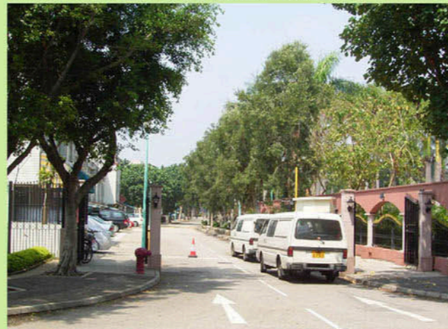
Southern Palm Springs and Royal Palms