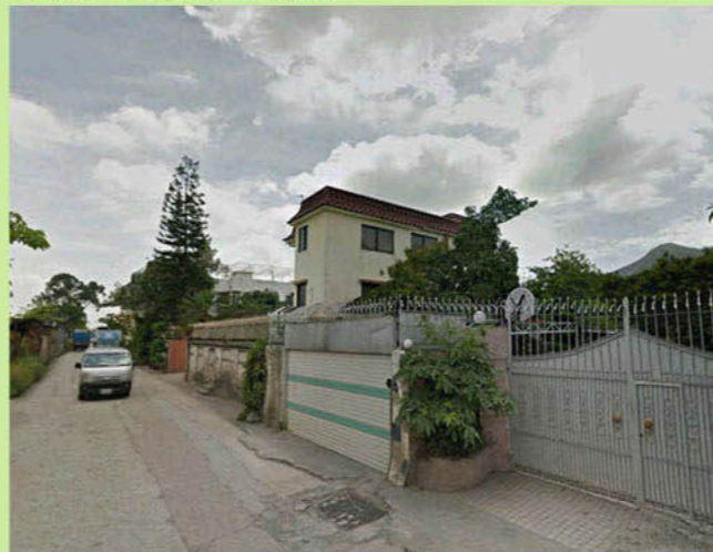
Chuk Yuen Tsuen Village