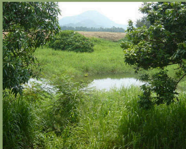
LR7.A - Pond and Pond Edge