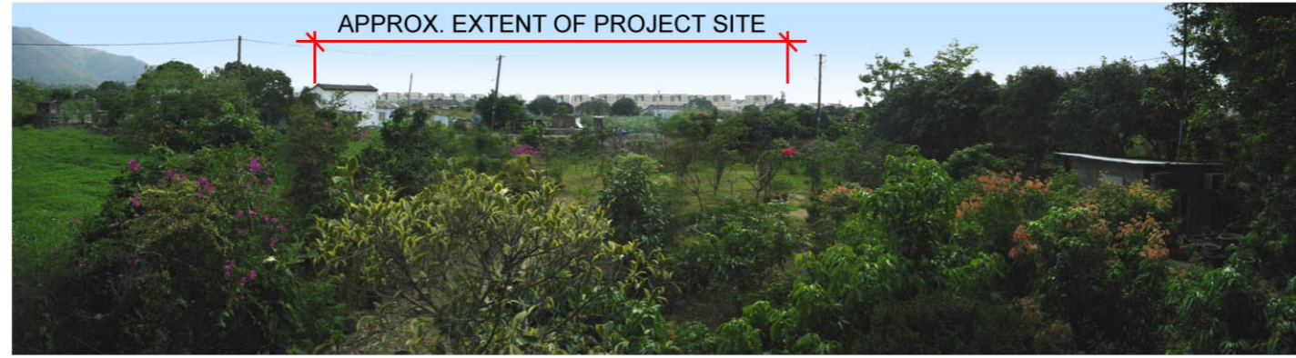
VIEW FROM VSR R3 SOUTHERN ROYAL PALMS - DAY 1 WITHOUT MITIGATION (VIEW POINT 9)