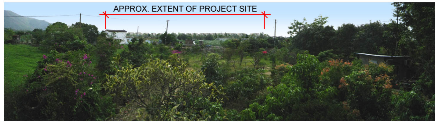
VIEW FROM VSR R3 SOUTHERN ROYAL PALMS - DAY 1 WITH MITIGATION (VIEW POINT 9)