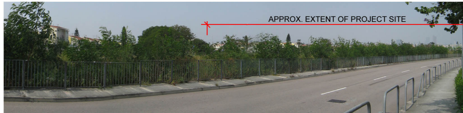
VIEW FROM VSR O3 CHUK YUEN FLOOD WATER PUMPING STATION - DAY 1 WITH MITIGATION (VIEW POINT 15)