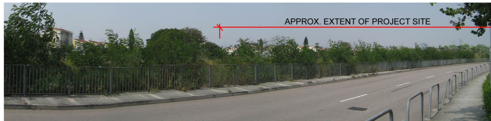
VIEW FROM VSR O3 CHUK YUEN FLOOD WATER PUMPING STATION - YEAR 10 WITH MITIGATION (VIEW POINT 15)