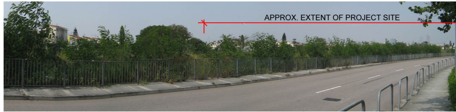
VIEW FROM VSR O3 CHUK YUEN FLOOD WATER PUMPING STATION - EXISTING SITUATION (VIEW POINT 15)