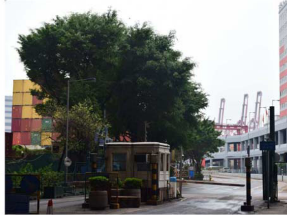
■ LR14 Roadside Planting Inside Container Terminal