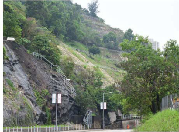
■ LR13 Man-made Slope