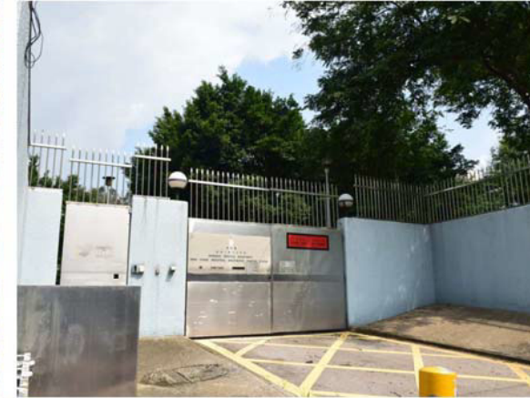
■ LR16 Planting at DSD Kwai Chung Industrial Wastewater Pumping Station