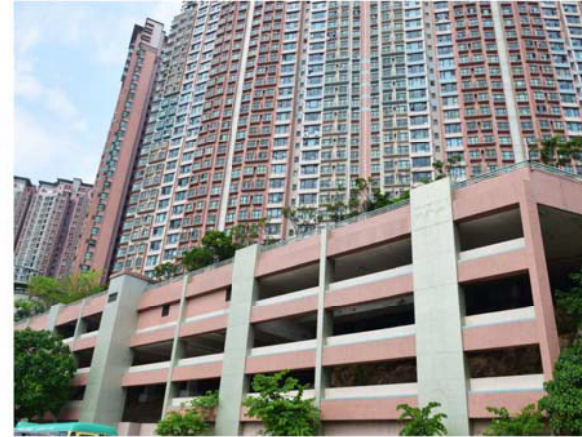
■ LR15 Planting at Highland Park