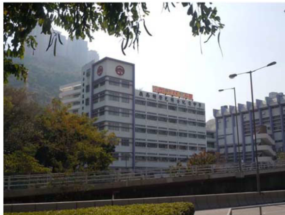
O8 Staffs at Lingnan Dr. Chung Wing Kwong Memorial Secondary School