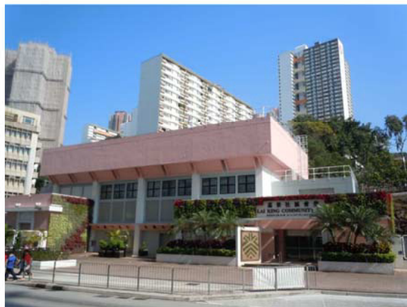
O12 Staff and Visitors to Lai King Community Hall