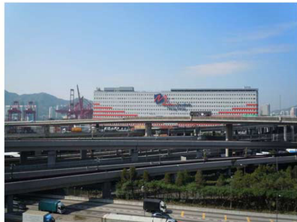
O7 Staffs and Workers at Container Terminals