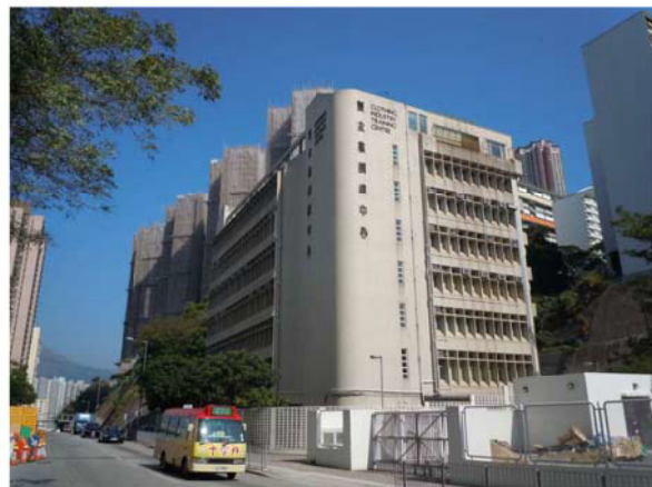
O11 Staff and Visitors at OUHK – CITA Lai King Learning Centre