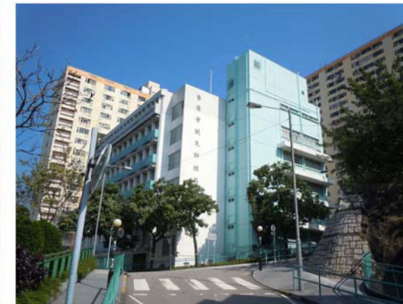
O10 Staffs at Lai King Assessment Centre