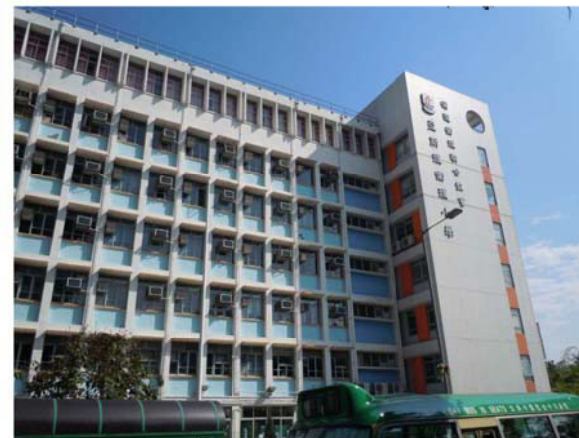
O13 Staff and Students at Asbury Methodist Primary School