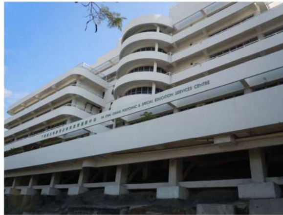
O4 Staffs & Visitors at Polyclinic & Special Educational Services