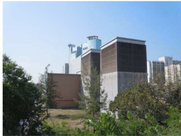
O3 Workers at Kwai Fong Ancillary Building