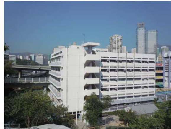
O5 Staffs & Students at Lai King Catholic Secondary School