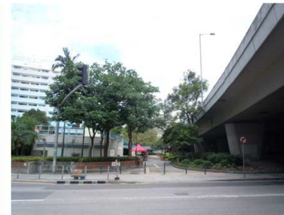
L1 Visitors to Kwai Shun Street Playground