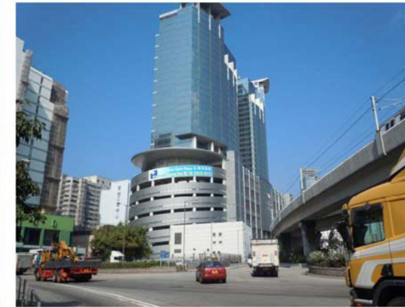
O6 Workers at Ever Gain Plaza