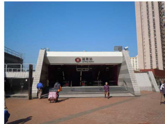
O9 Staffs at Lai King MTR Station