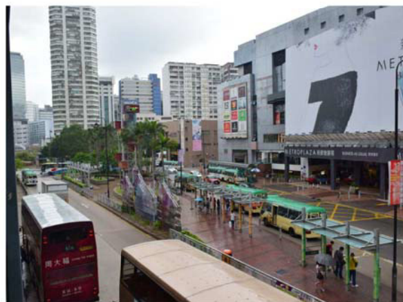
■ T6 Travellers to Kwai Fong Core Area