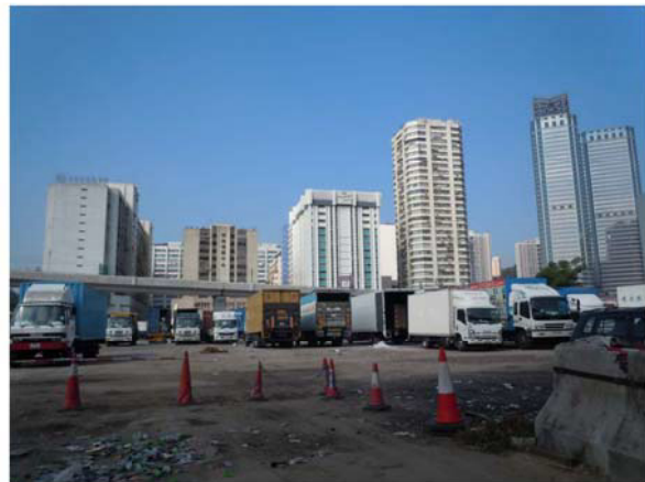
■ T1 Open Storage Area Car Park Users