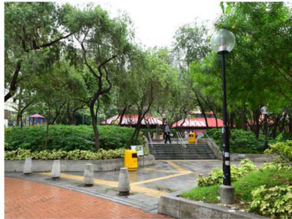
■ L2 Visitors to Kwai Yip Road Playground