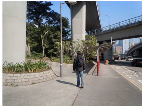
■ T2 Pedestrians travelling on Street Level under Kwai Chung Road Interchange Area