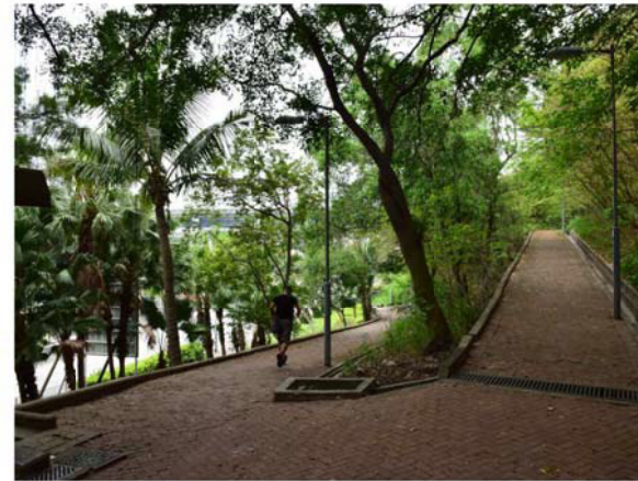
■ L4 Visitors to Kwai Chung Park