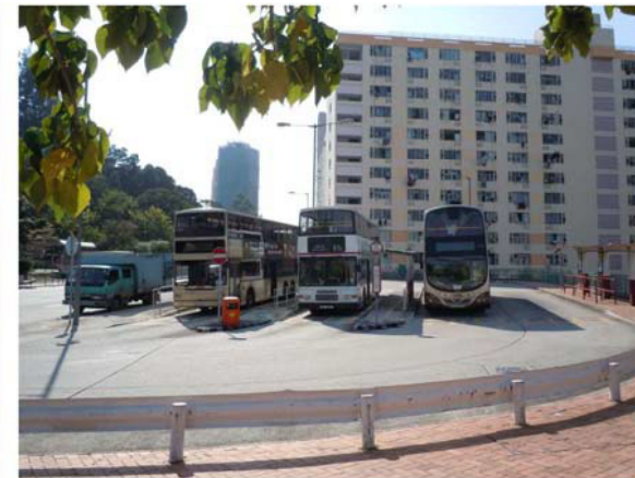
■ T4 Commuters at Lai King Bus Terminus