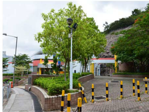
■ L3 Visitors to Lai King Sports Centre