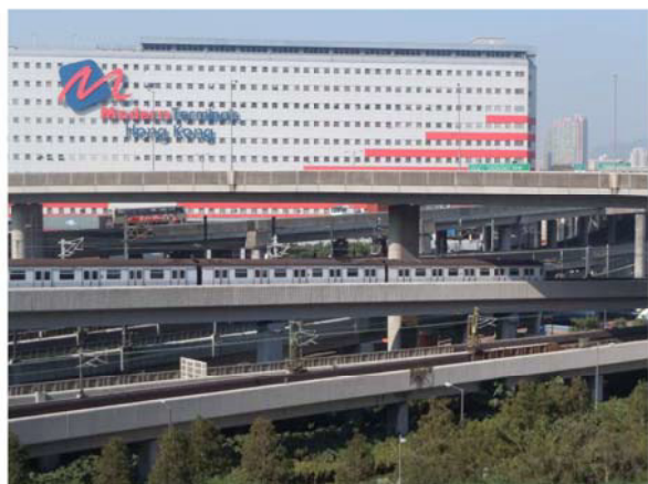
■ T5 Commuters on MTR