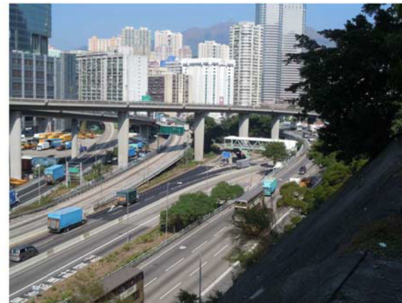
■ T3 Commuters on Tsuen Wan Road/Kwai Chung Road