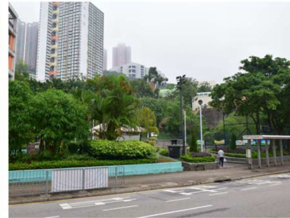
■ L5 Visitors to Lai King Hill Road Playground