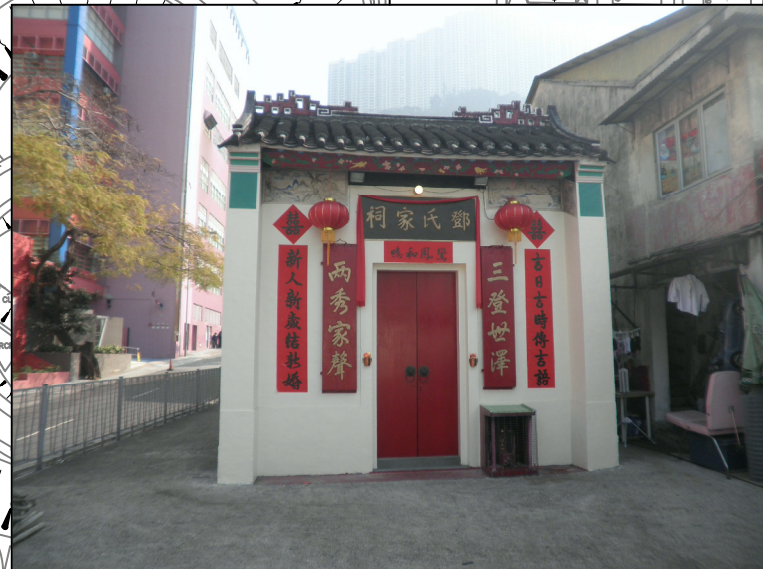
The Tang Ancestral Hall at Ha Kwai Chung Tsuen (about 600m away from the Project boundary)