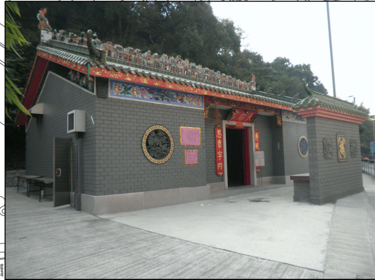
Tin Hau Temple (about 400m away from the Project boundary)