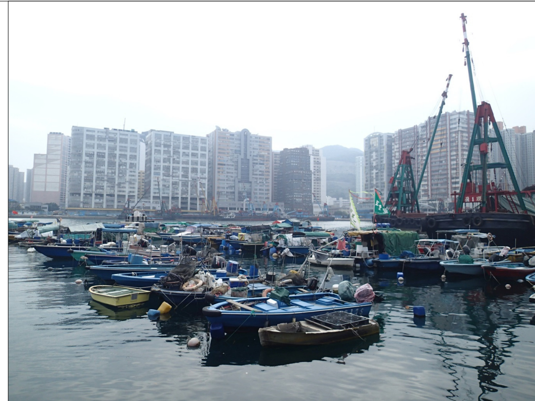
LCA4 & LCA6