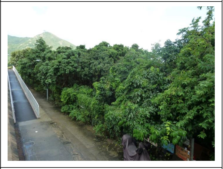
Agricultural Land (dry, active)