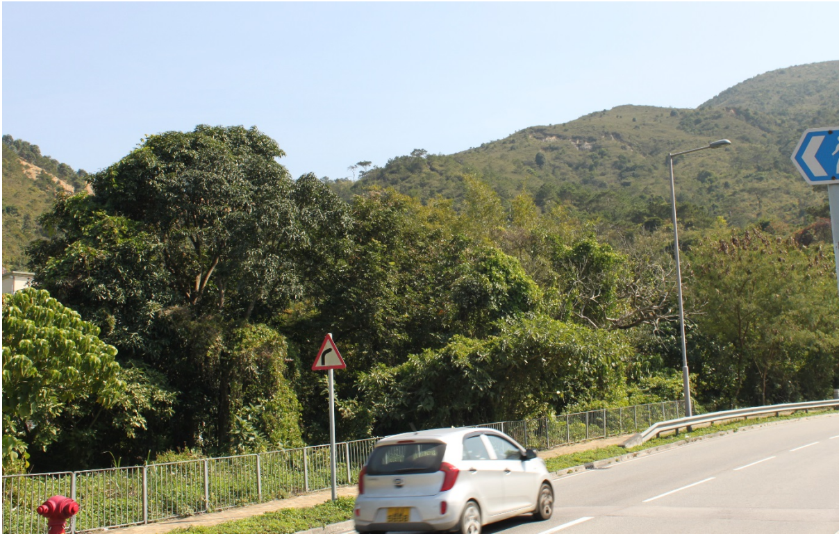
LR 1e Secondary Woodland near Lung Tseng Tau