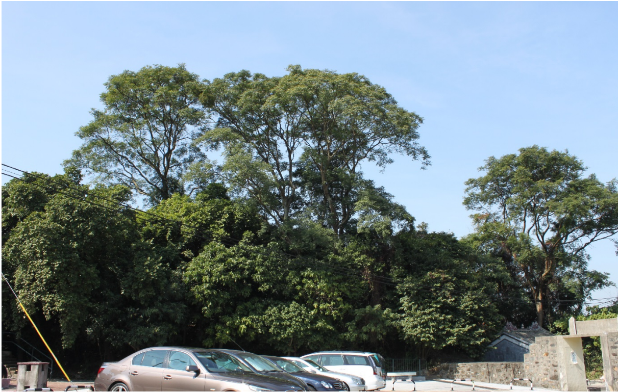
LR 1f Secondary Woodland near Shek Mun Kap