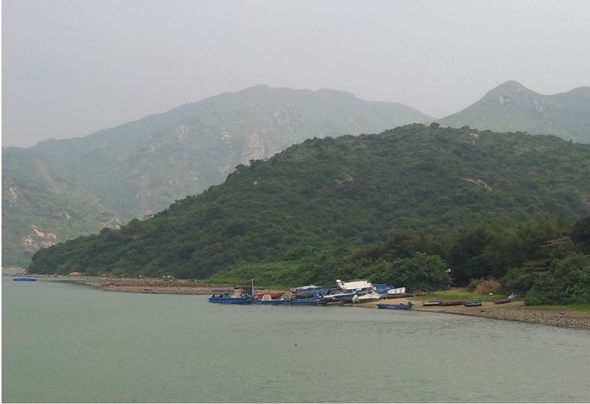
LR 2a Shrubland and Grassland near Tai Ho Wan and Siu Ho Wan