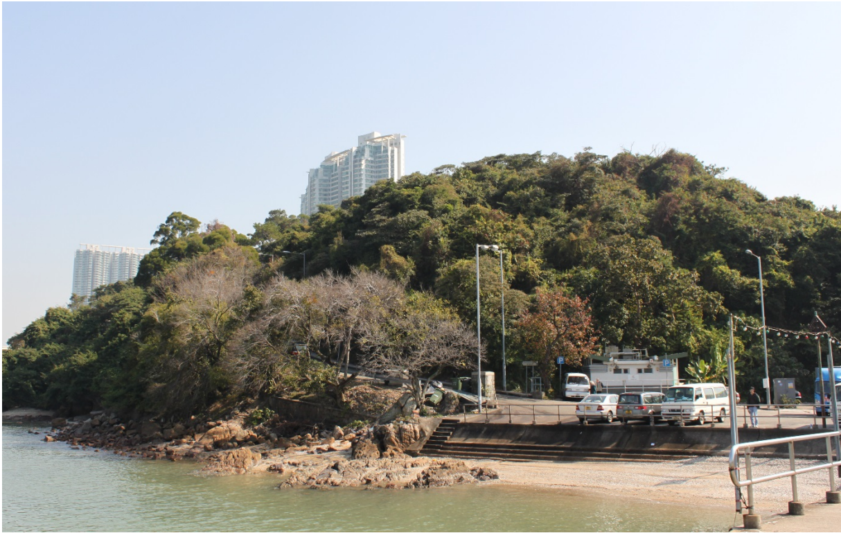
LR 1f Secondary Woodland near Ma Wan Hill