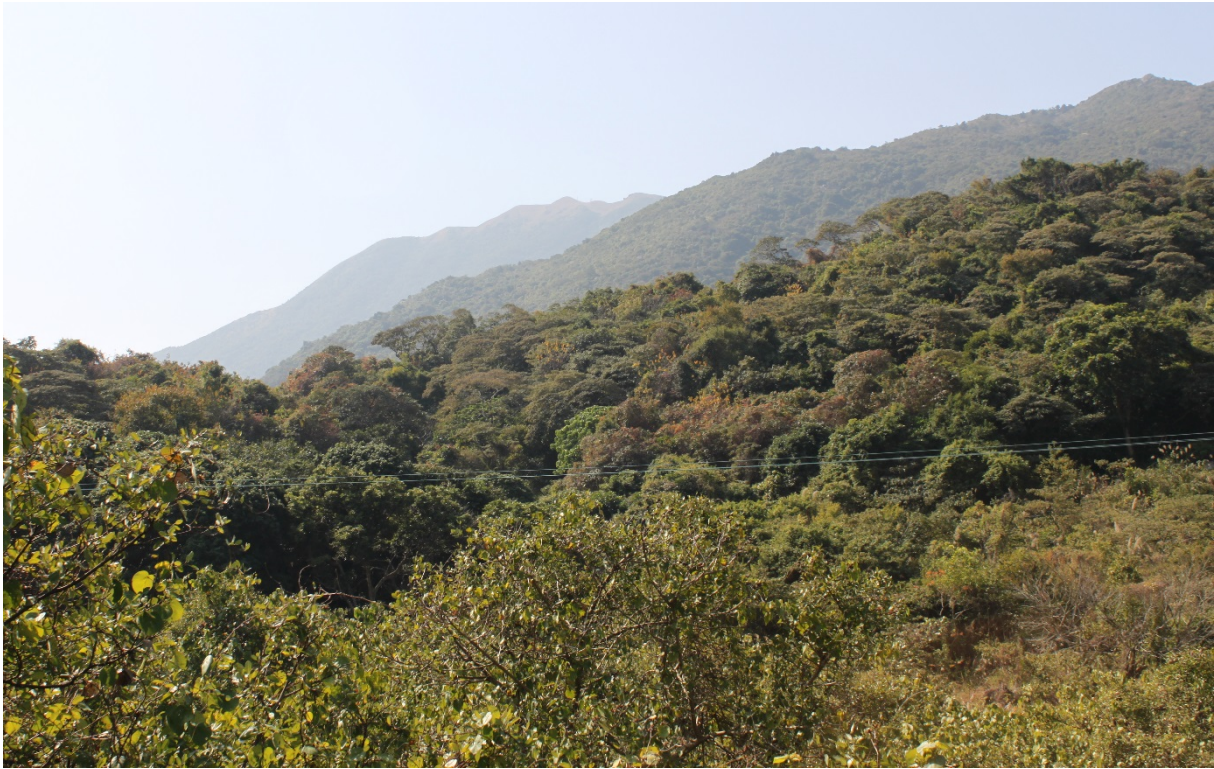
LR1i Secondary Woodland near Ngau Au