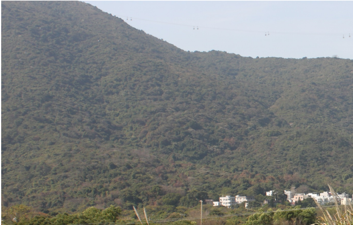
LR2g Shurbland and Grassland near Tung Hing