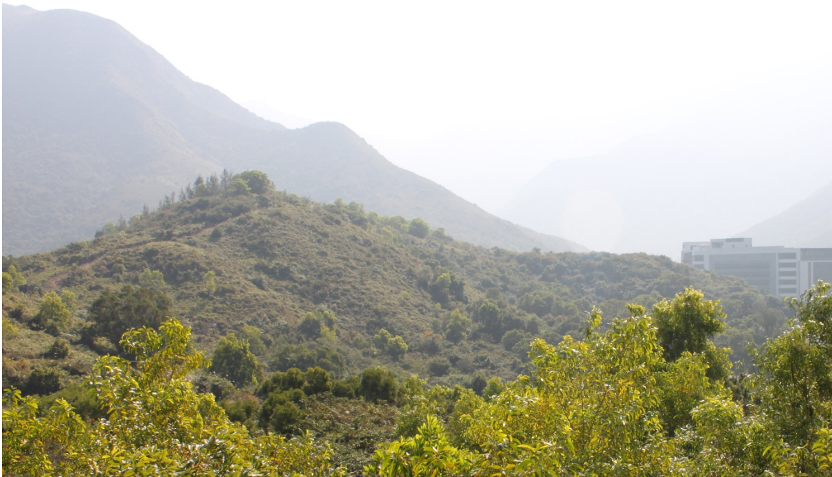
LR 2h Shrubland and Grassland near Ma Wan Hill