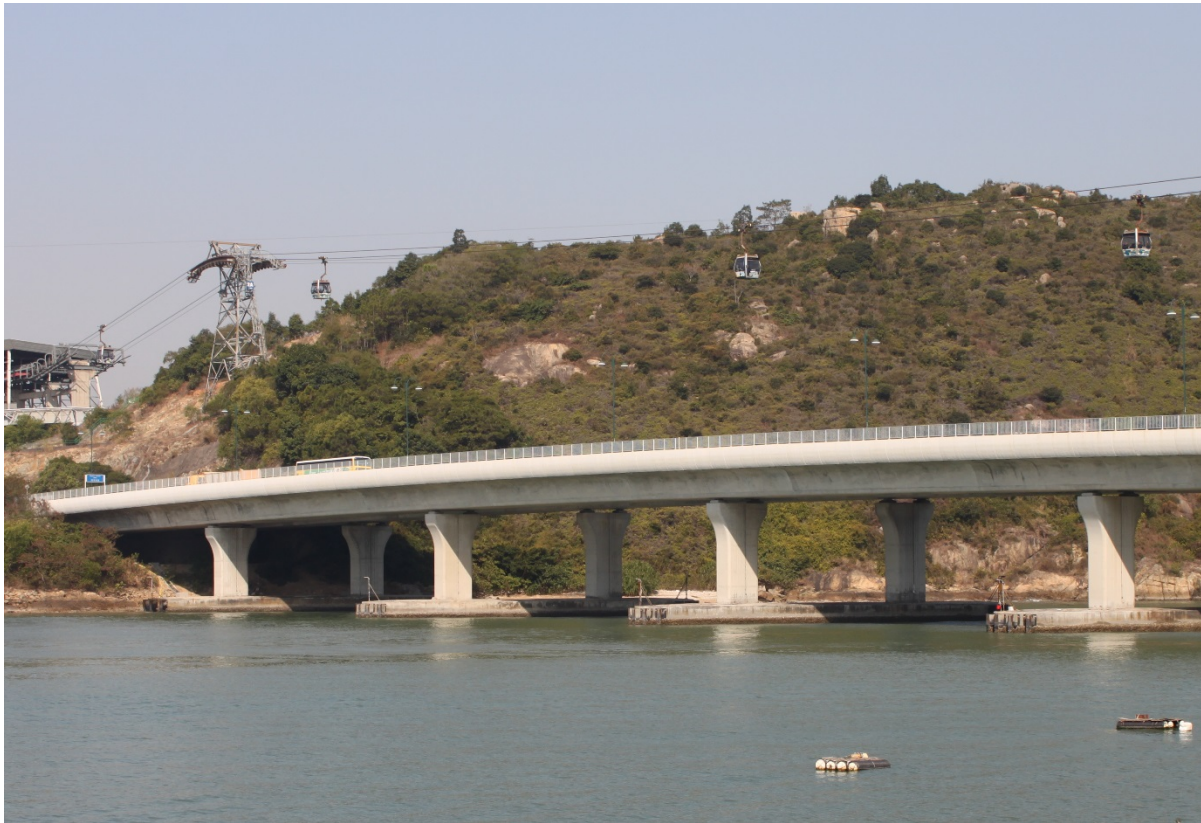
LR 2i Shrubland and Grassland near Scenic Hill