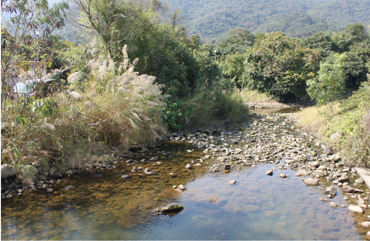
LR 5a Natural Streams and Rivers