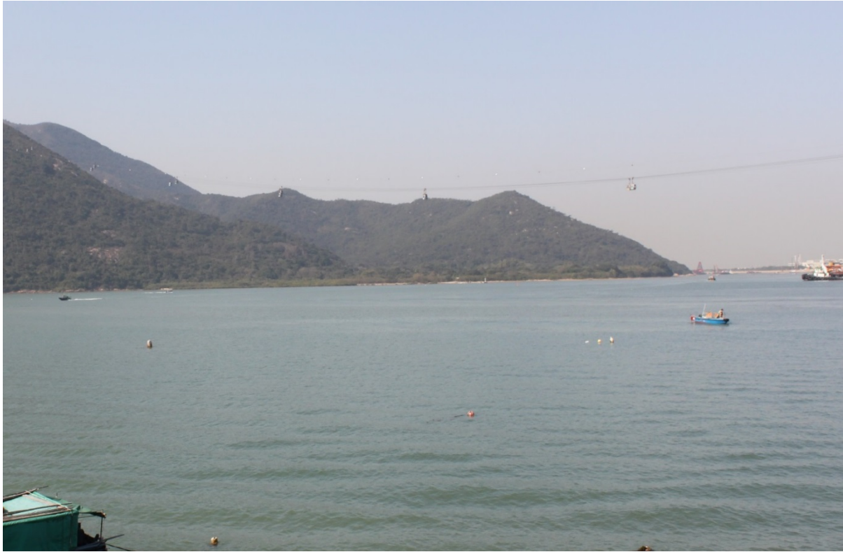
LR 4 Coastal Waters