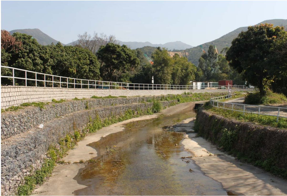
LR 5b Channelized Watercourse