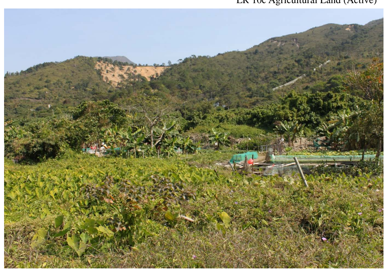
LR 10c Agricultural Land (Active)