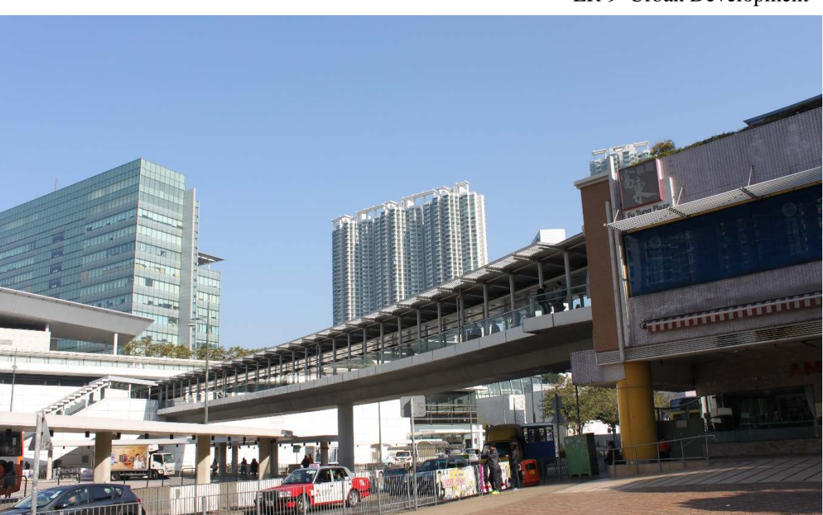
LR 9 Urban Development