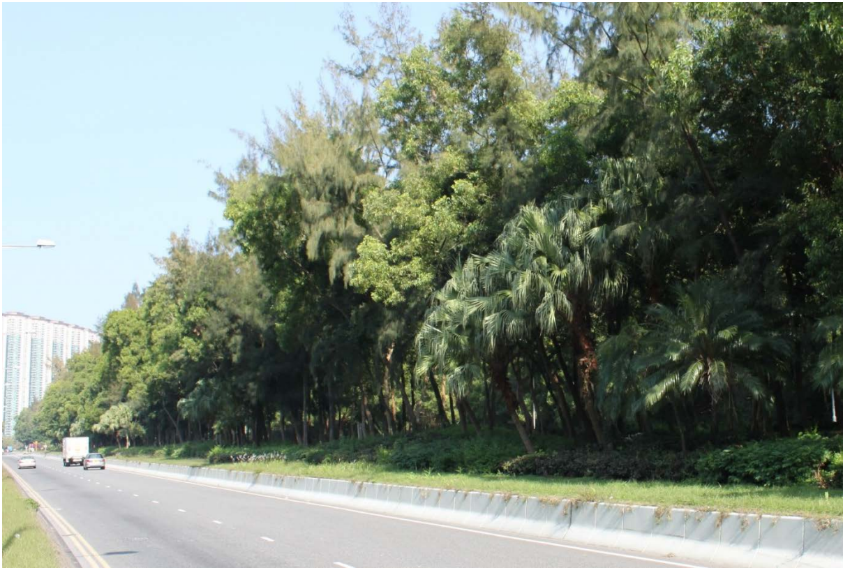
LR 11 Plantation