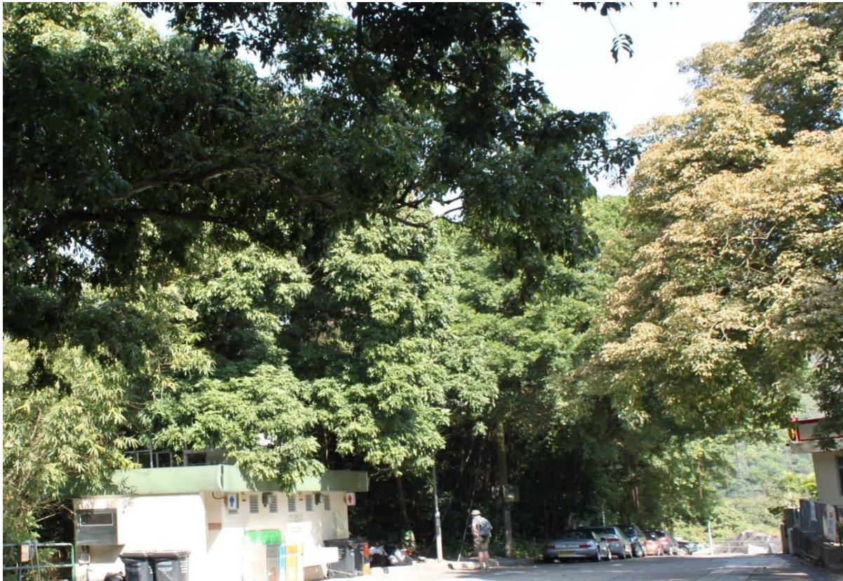
LR 12 Fung Shui Woodland