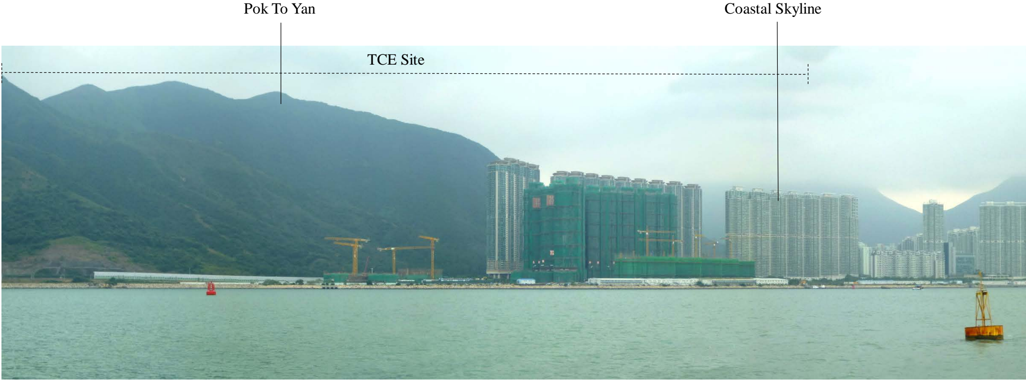
VSR 45: TMCLKL

DO NOT SCALE DRAWING. CHECK ALL DIMENSIONS ON SITE. ALL RIGHTS RESERVED. © DVE, ARUP & PARTNERS HONG KONG LIMITED.