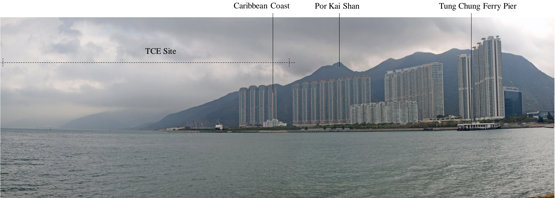
VSR 4: NEAR SITTING OUT AREA