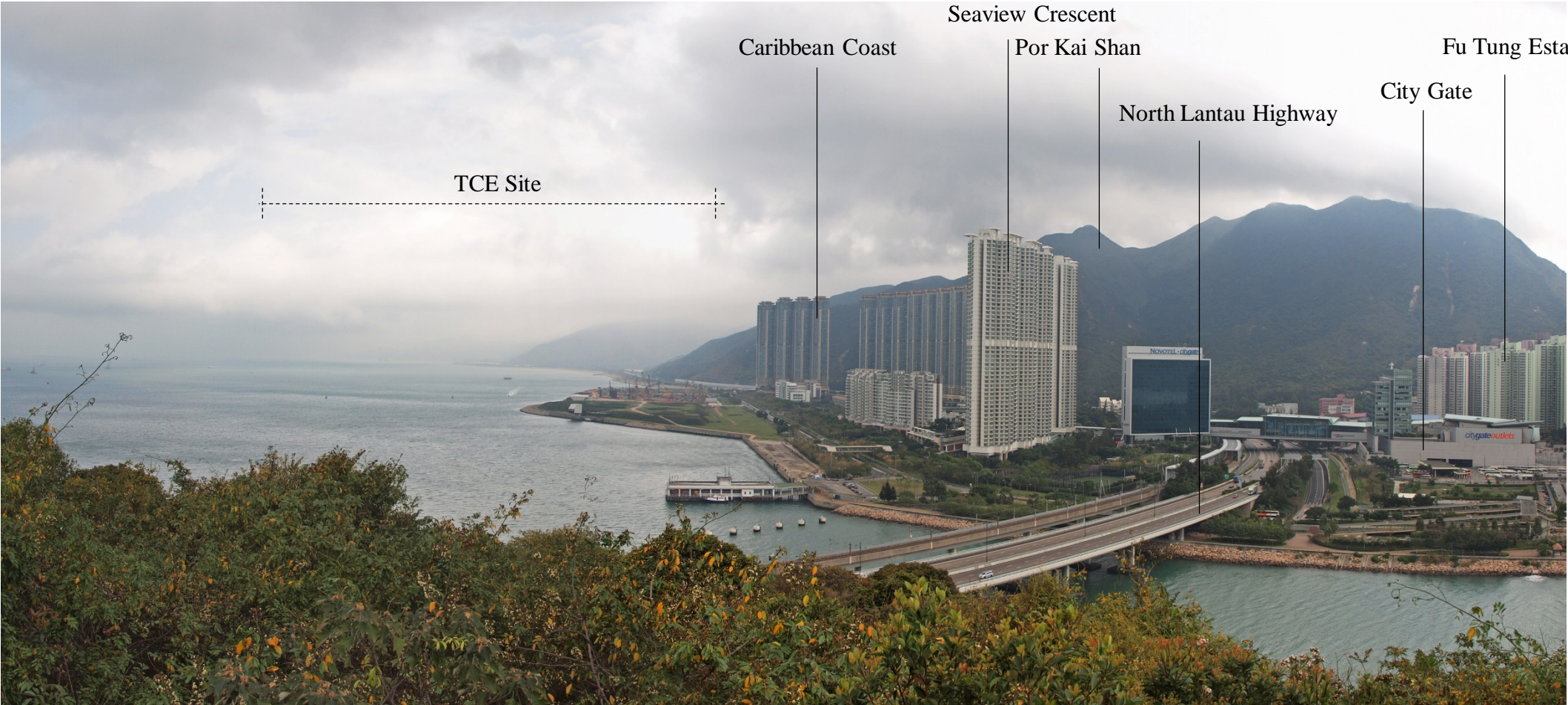
VSR 5: SCENIC HILL EAST