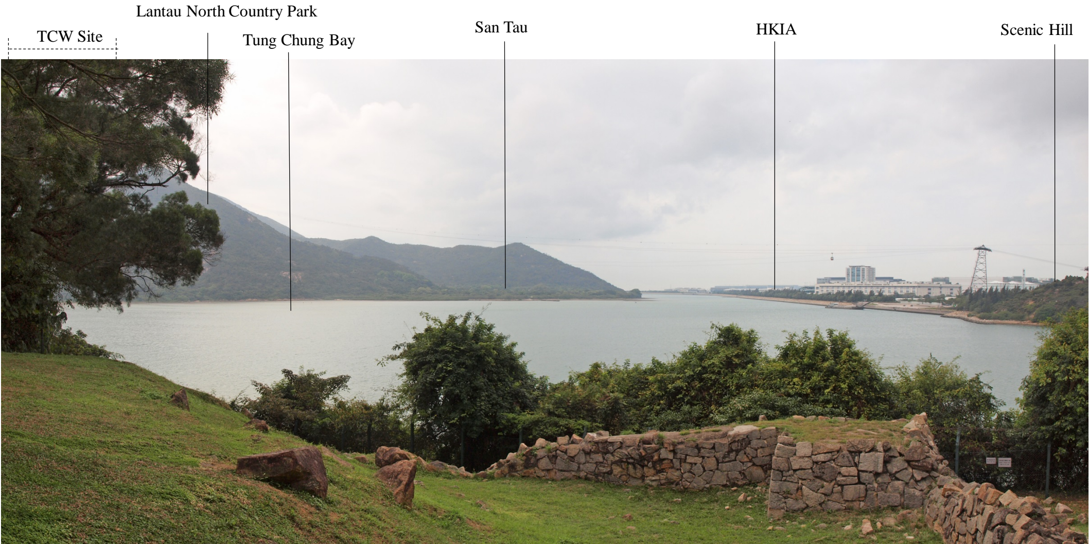
VSR 9: TUNG CHUNG BATTERY

DO NOT SCALE DRAWING. CHECK ALL DIMENSIONS ON SITE. ALL RIGHTS RESERVED. © DVE, ARUP & PARTNERS HONG KONG LIMITED.