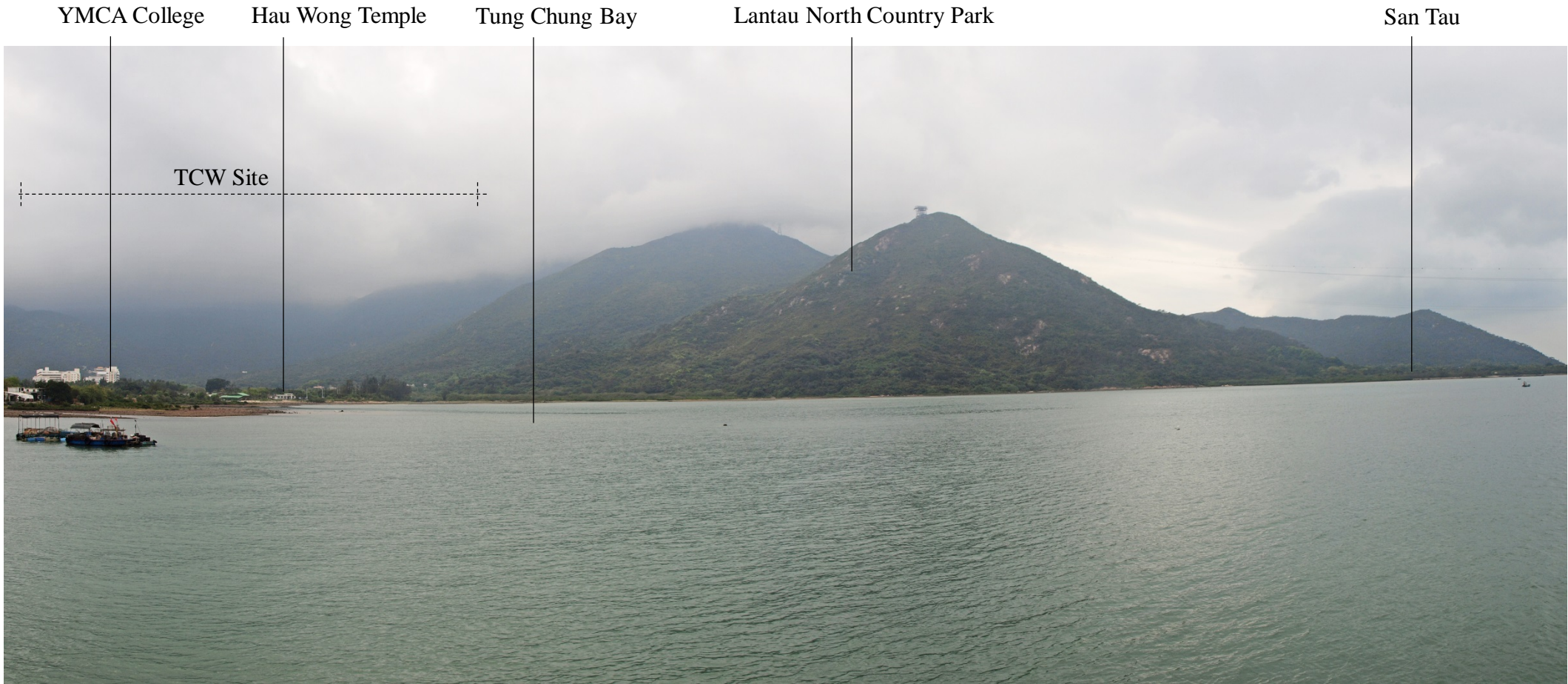
VSR 11: MA WAN CHUNG PIER – FACING SOUTHWEST