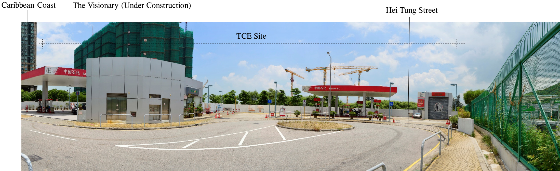
VSR 12: NEAR YING HEI ROAD