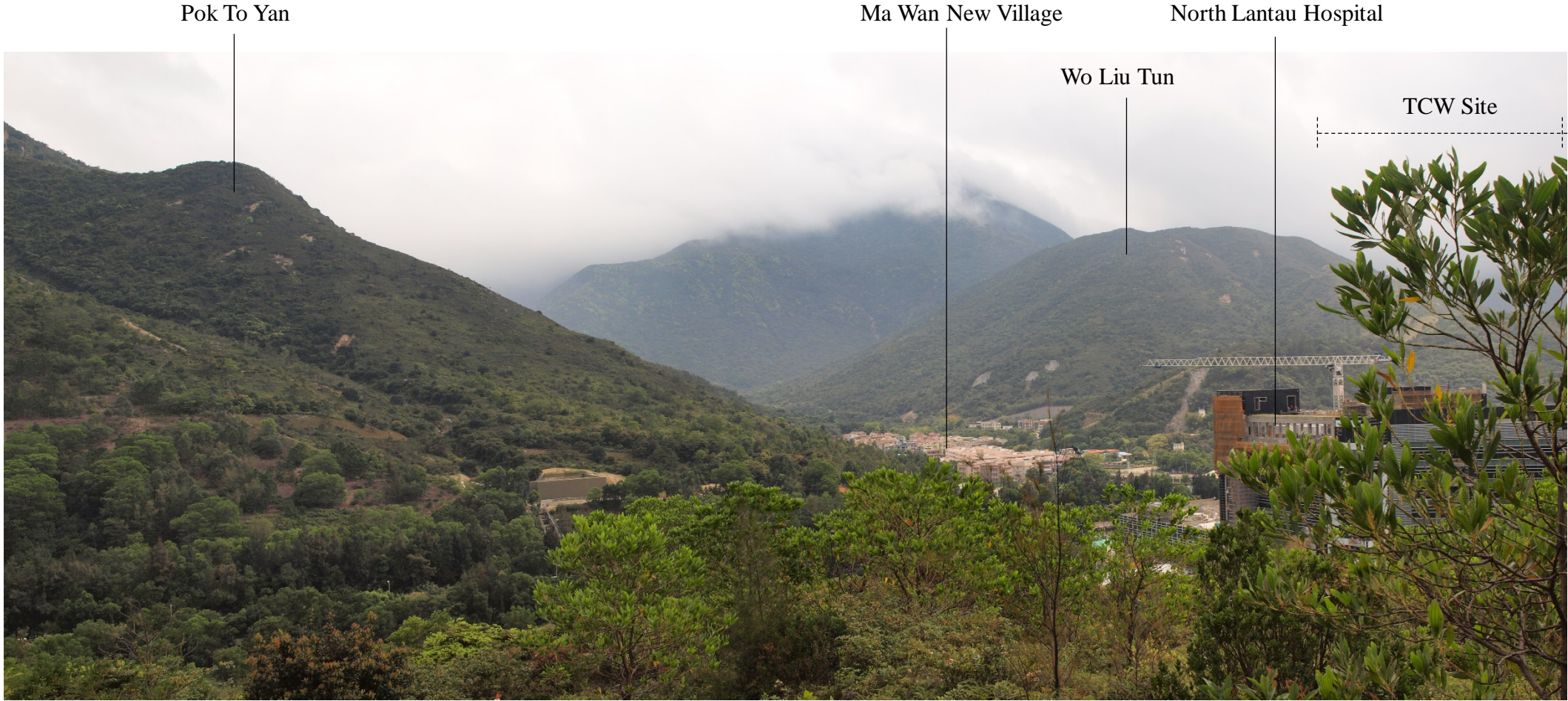
VSR 14: HILLTOP OF PLANNED OPEN SPACE – FACING SOUTHWEST