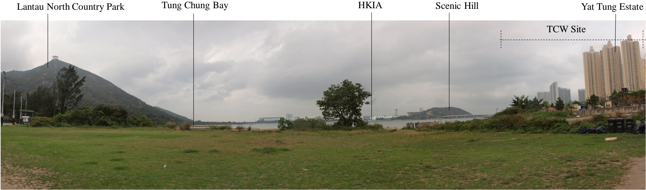
VSR 16: HAU WONG TEMPLE