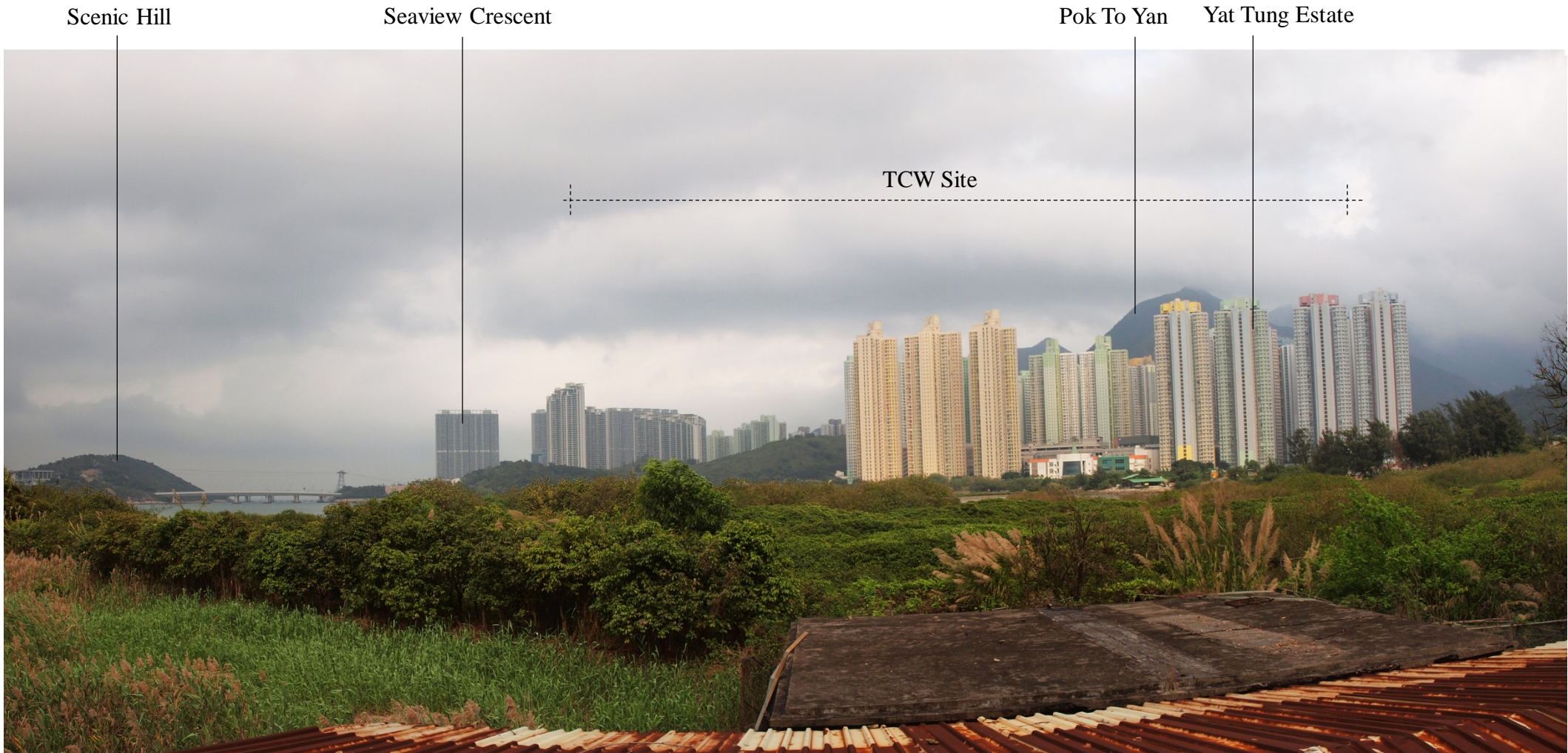
VSR 19: NEAR NGAU AU

DO NOT SCALE DRAWING. CHECK ALL DIMENSIONS ON SITE. ALL RIGHTS RESERVED. © DVE ARUP & PARTNERS HONG KONG LIMITED.