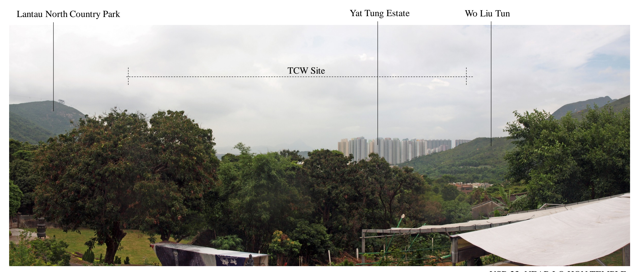
VSR 23: NEAR LO HON TEMPLE