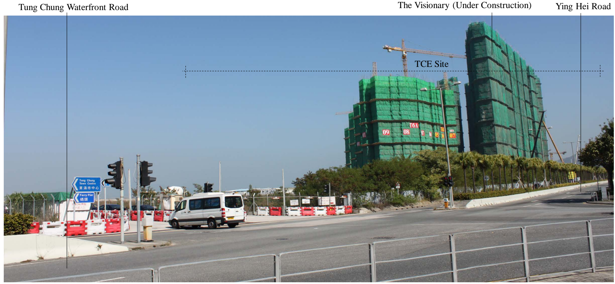
VSR 27: NEAR YI TUNG ROAD