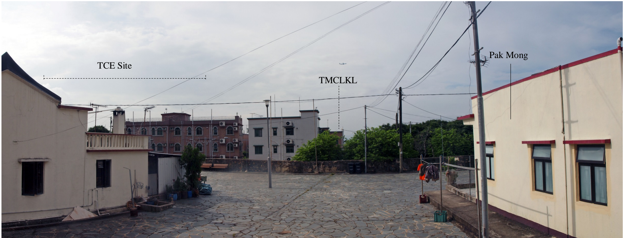
VSR 29: NEAR TAI HO