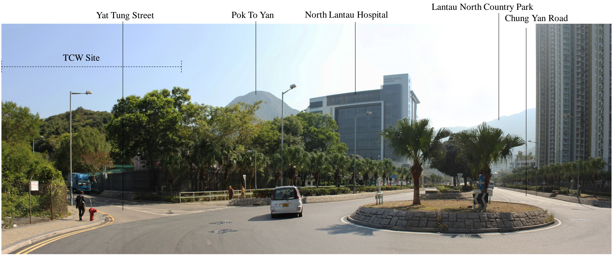
VSR 31: YAT TUNG ESTATE