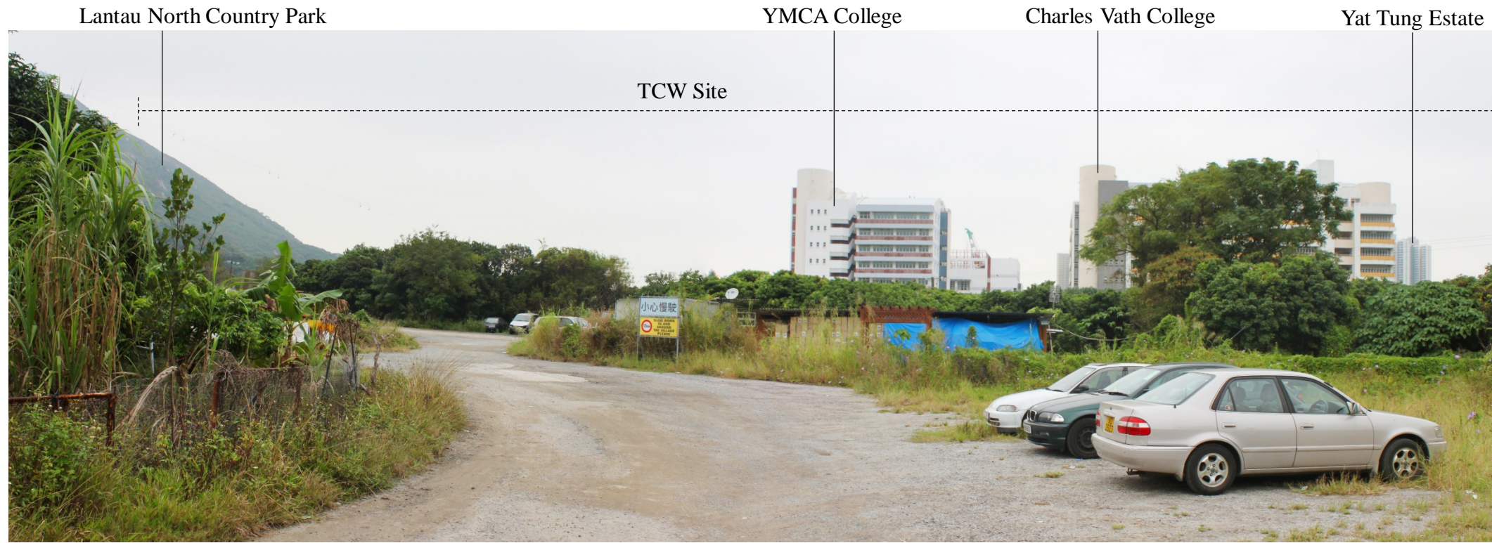
VSR 38: SHEK LAU PO