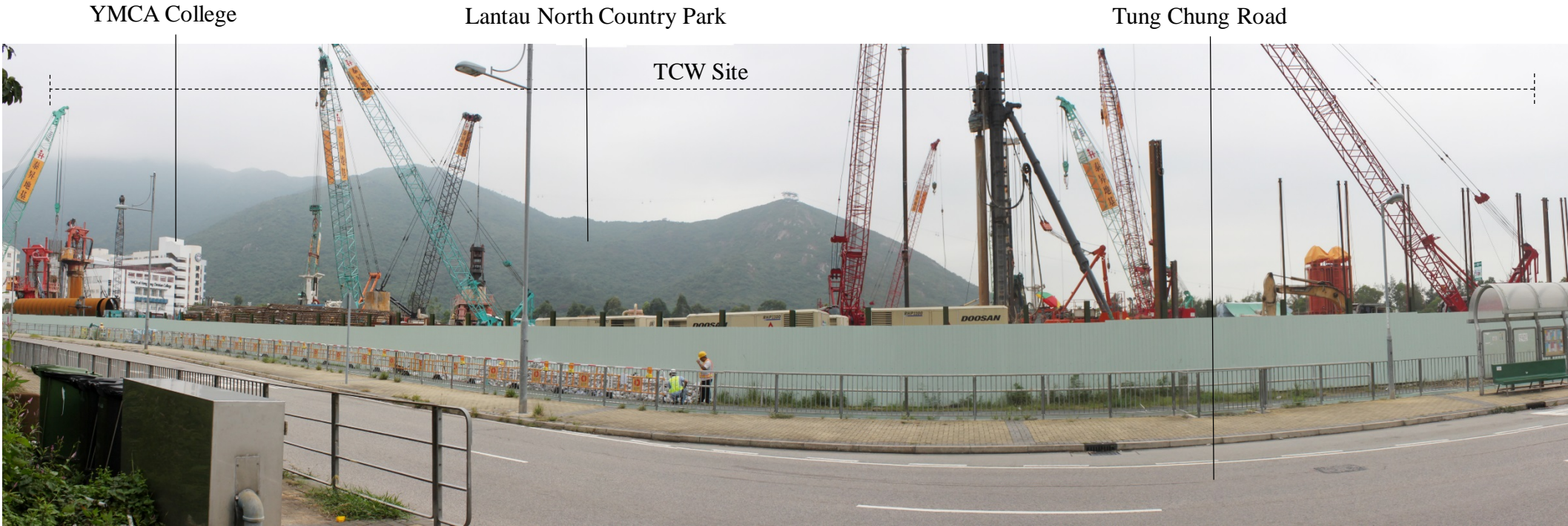
VSR 39: NEAR WONG KA WAI

DO NOT SCALE DRAWING. CHECK ALL DIMENSIONS ON SITE. ALL RIGHTS RESERVED. © DVE, ARUP & PARTNERS HONG KONG LIMITED.