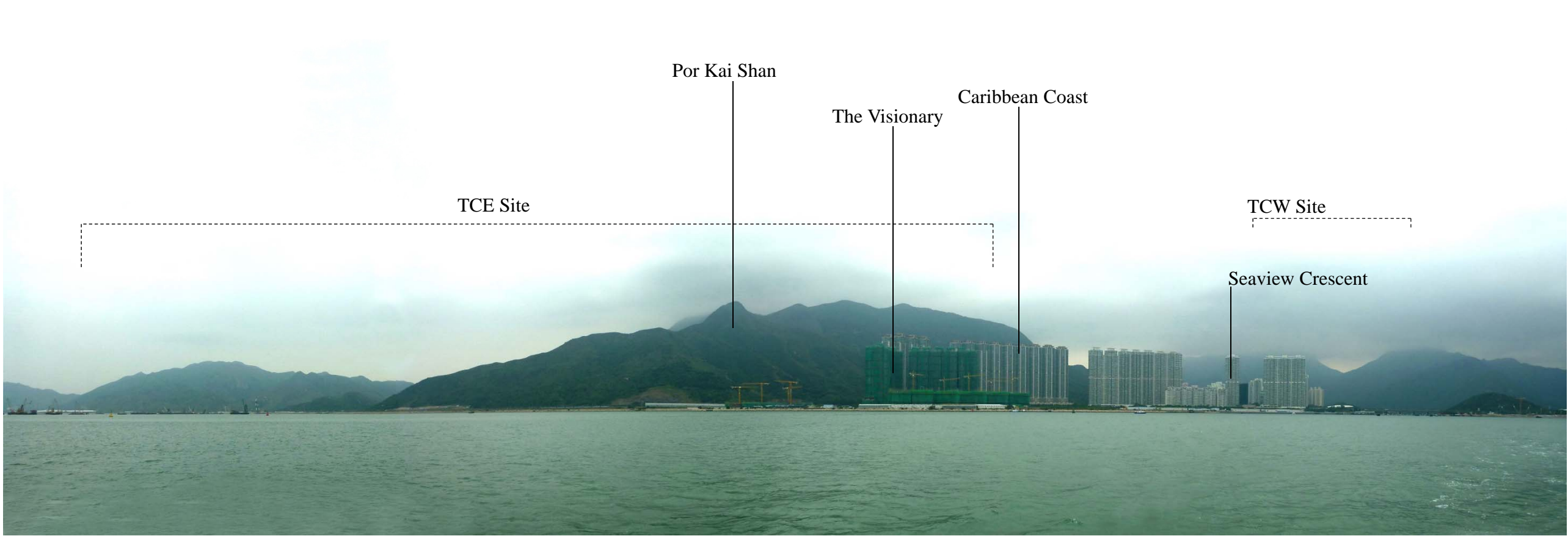
VSR 43 Existing View

DO NOT SCALE DRAWING. CHECK ALL DIMENSIONS ON SITE. ALL RIGHTS RESERVED. © 2016 ARUP & PARTNERS HONG KONG LIMITED.